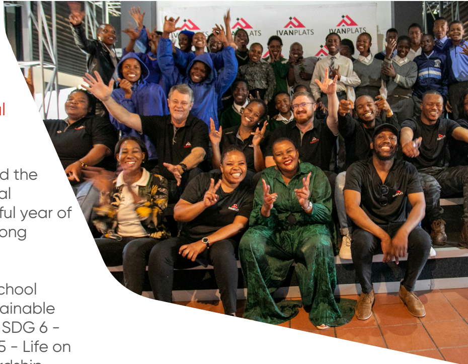
Students and teachers at the Environmental Competition.

The campaign aims to build a generation of environmentally conscious individuals who contribute innovative solutions to global challenges and implement sustainable practices within their communities.