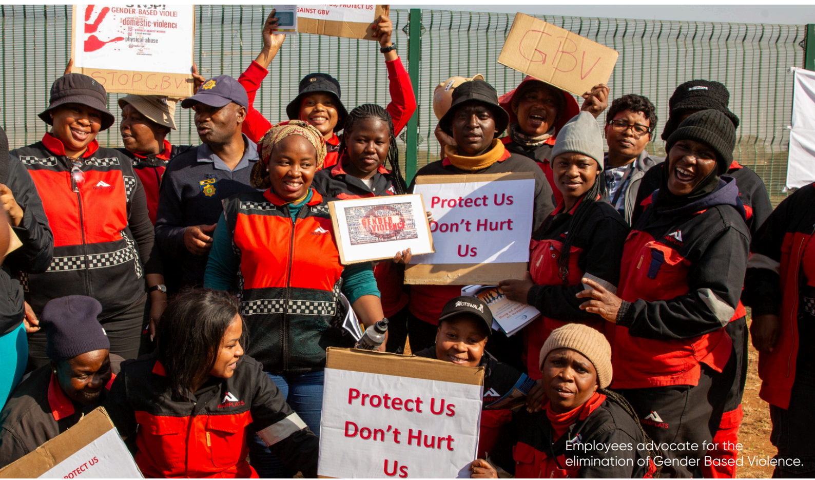
Employees advocate for the elimination of Gender Based Violence.