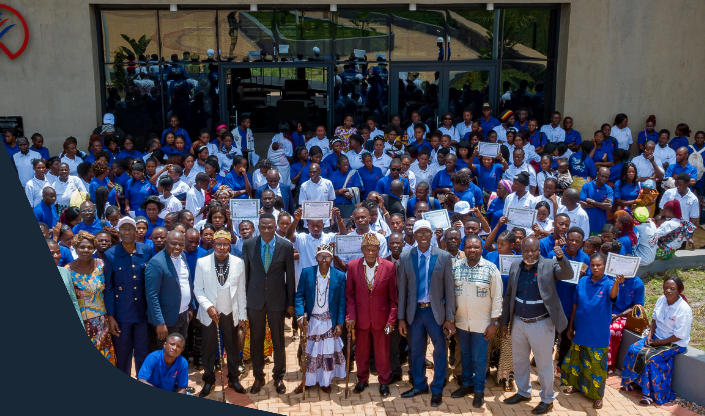
Graduates of the AlfaCongo literacy program.