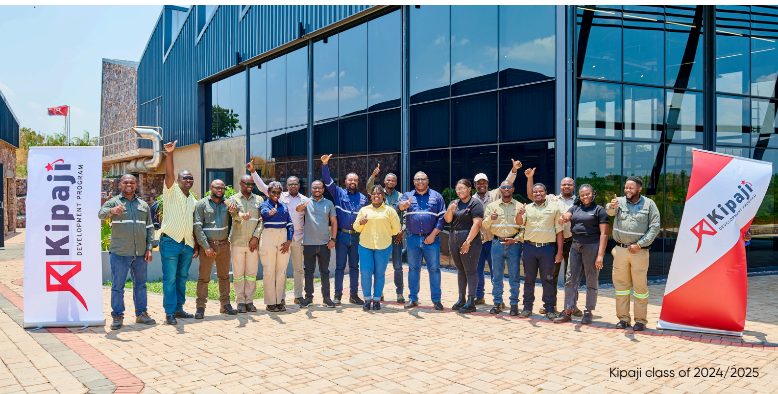
Kipaji class of 2024/2025