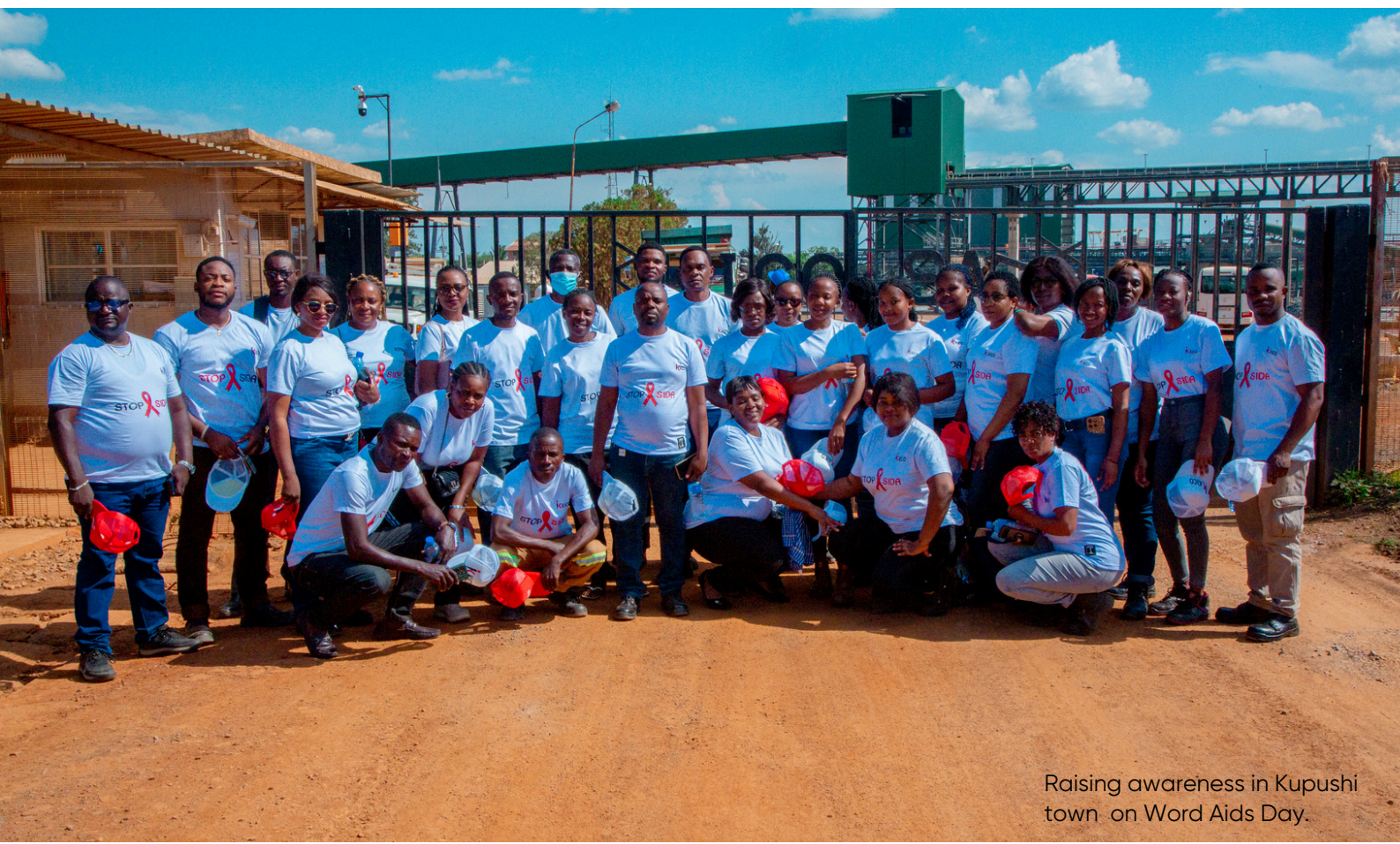
Raising awareness in Kipushi town on World Aids Day.

The Kipushi mine provides essential monthly food support to vulnerable community members in Kipushi town, including orphaned children, incarcerated individuals, elderly residents, and people with disabilities. In December, the Kipushi team expanded their outreach by distributing additional food supplies and clothing, while joining these underserved groups in holiday celebrations.