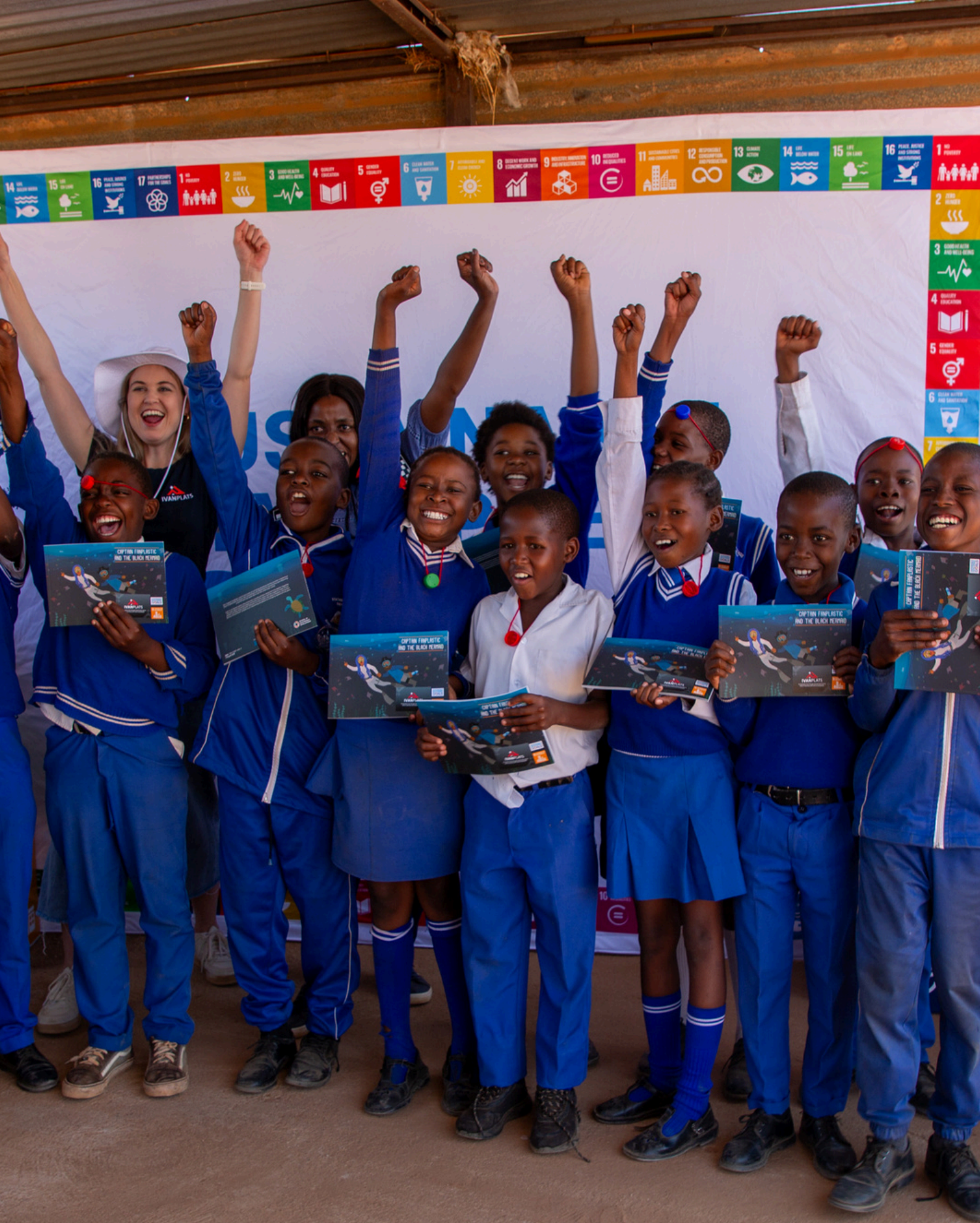
Young students embrace a day of learning with Captain Fanplastic.