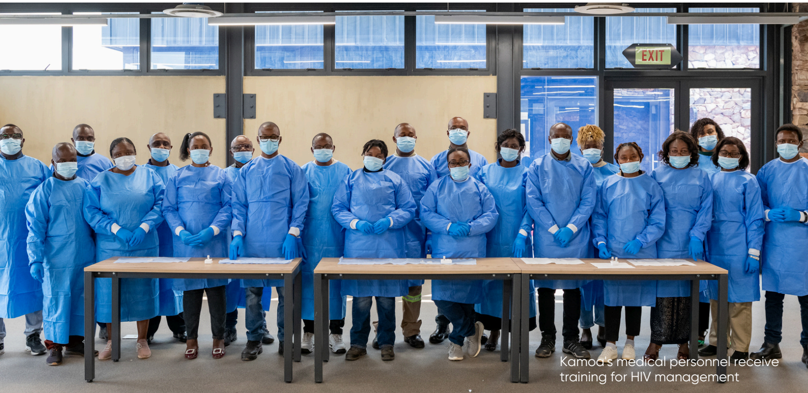
Kamoa's medical personnel receive training for HIV management