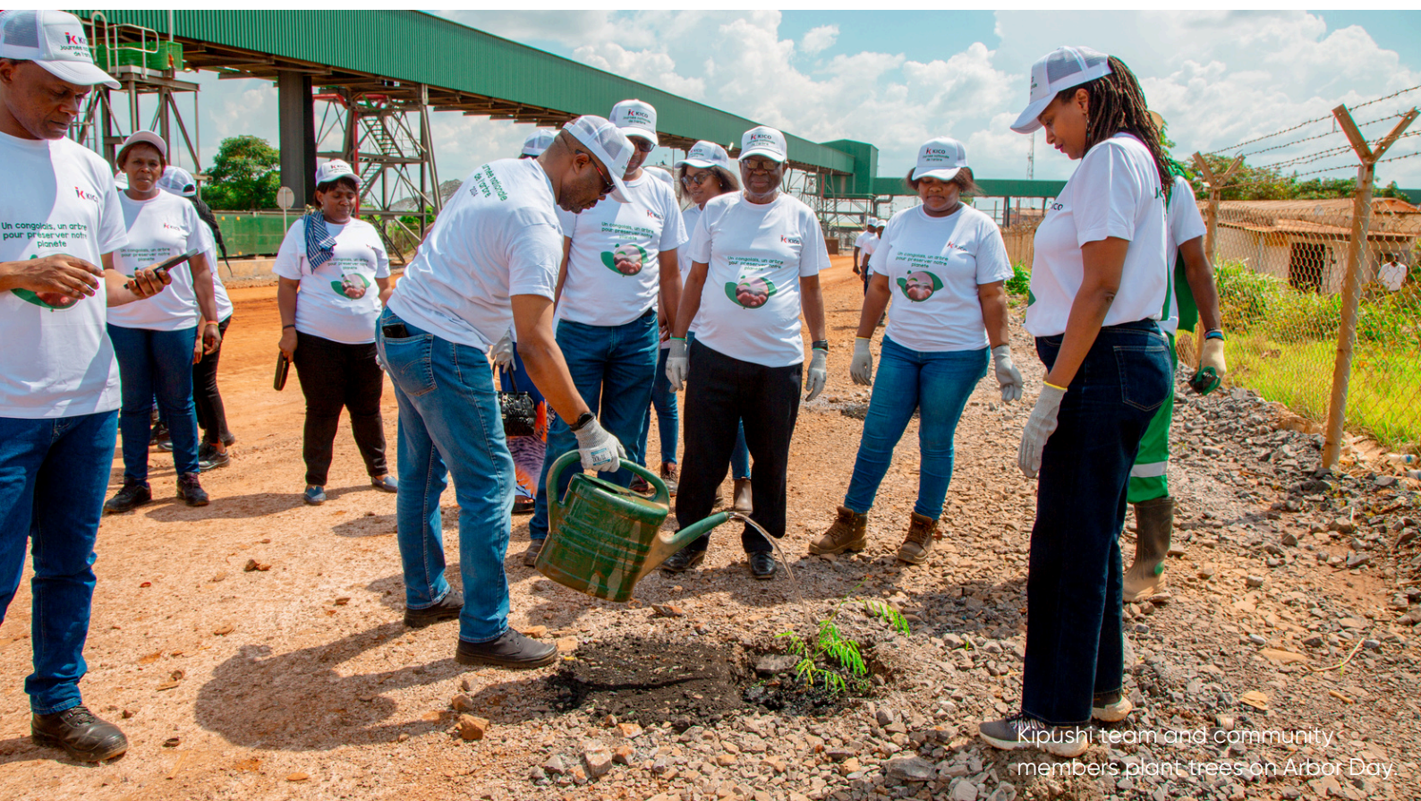
Kipushi team and community members plant trees on Arbor Day.