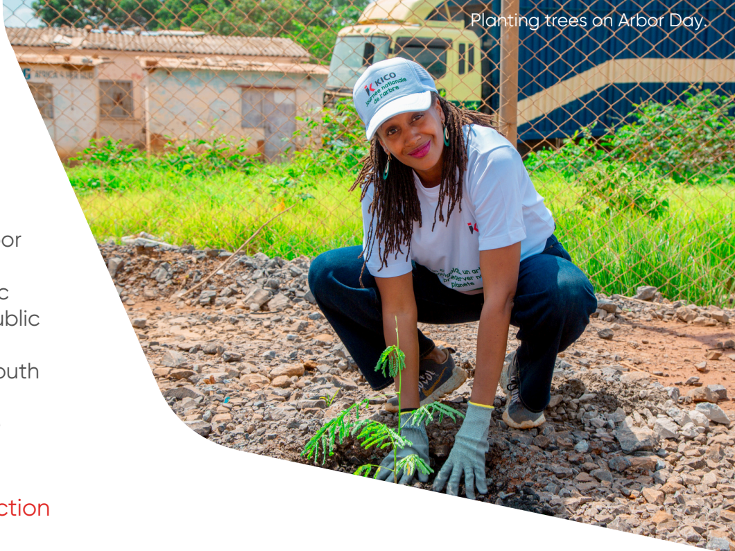
Planting trees on Arbor Day.

The launch of the Kipushi poultry project has seen incredible progress with a record of 72 daily egg trays produced.