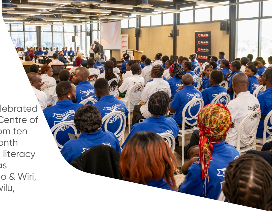
Students from the AlfaCongo Adult Literacy Program.

The AlfaCongo Adult Literacy Program celebrated its fifth annual graduation at the Kamoa Centre of Excellence. In 2023-2024, 205 students from ten local communities completed the nine-month program, gaining essential numeracy and literacy skills. Graduates represented diverse areas including Samukoko, Kyamadingi, Kangaso & Wiri, Kakunta, Muvunda, Mupenda, Djosayi, Mwilu, Kolanga, and Kaponda.