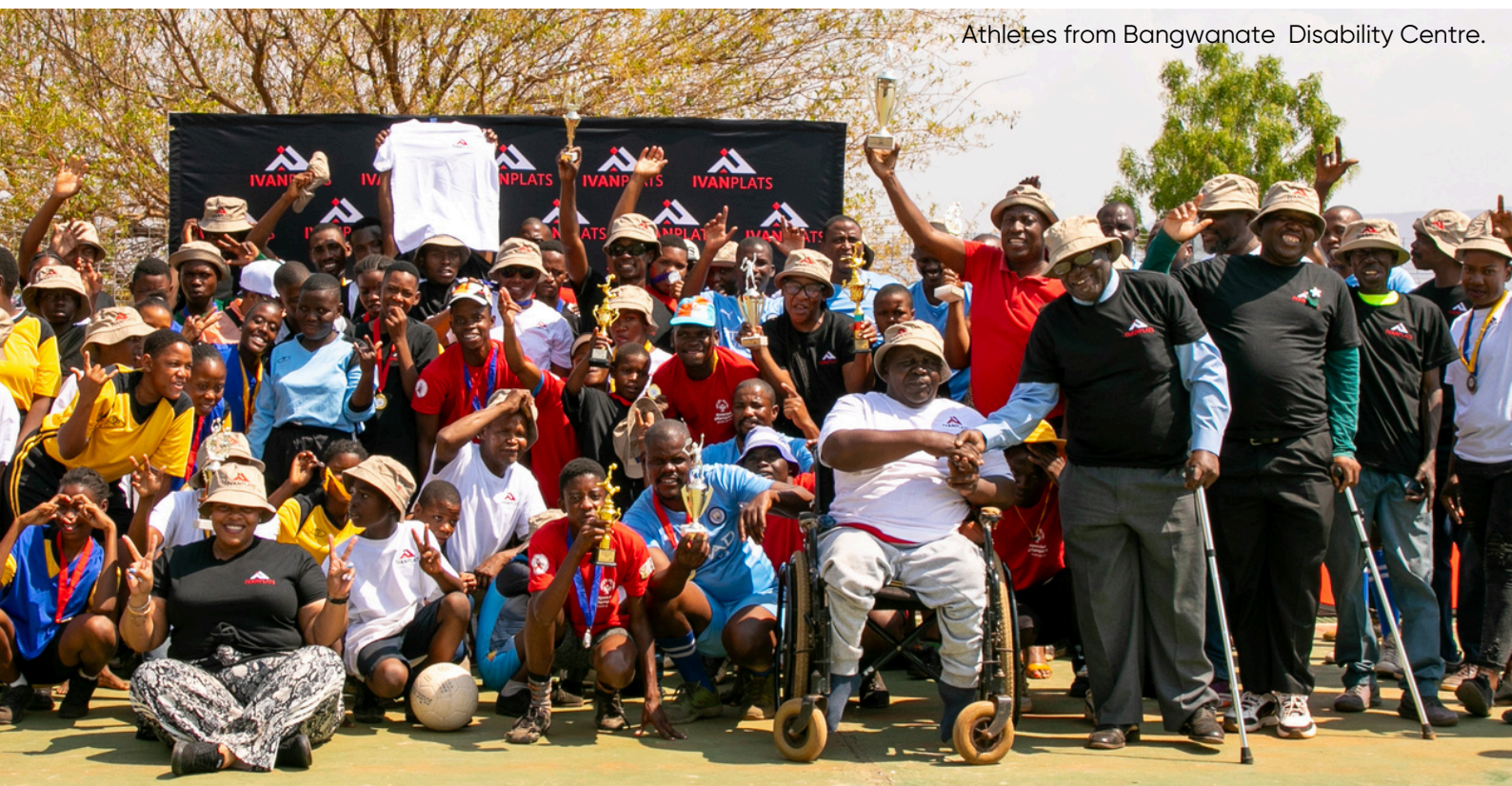
Athletes from Bangwanate Disability Centre.