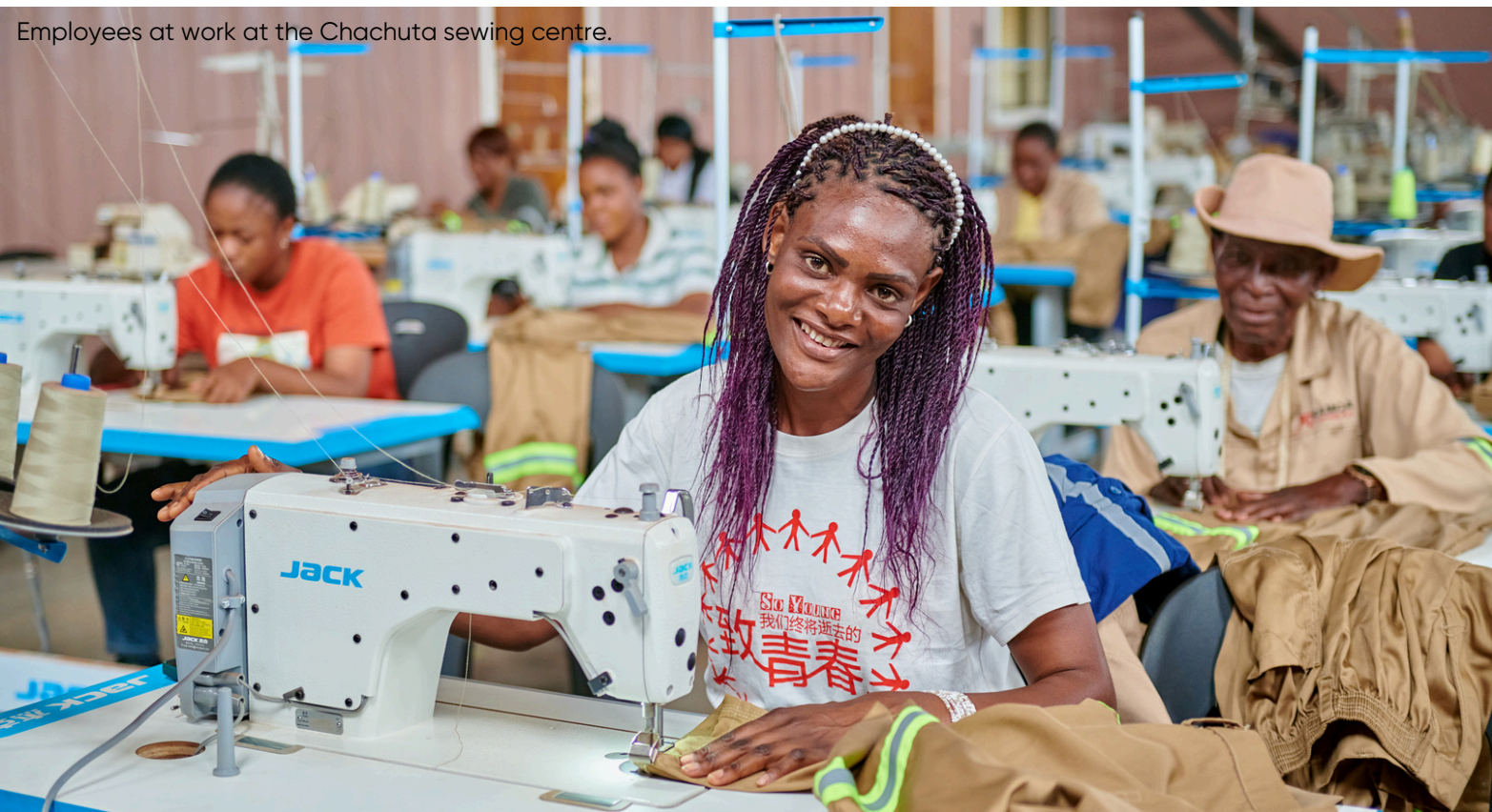
Employees at work at the Chachuta sewing centre.