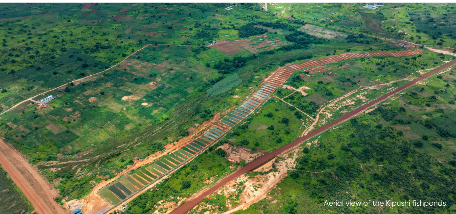
Aerial view of the Kipushi fishponds.