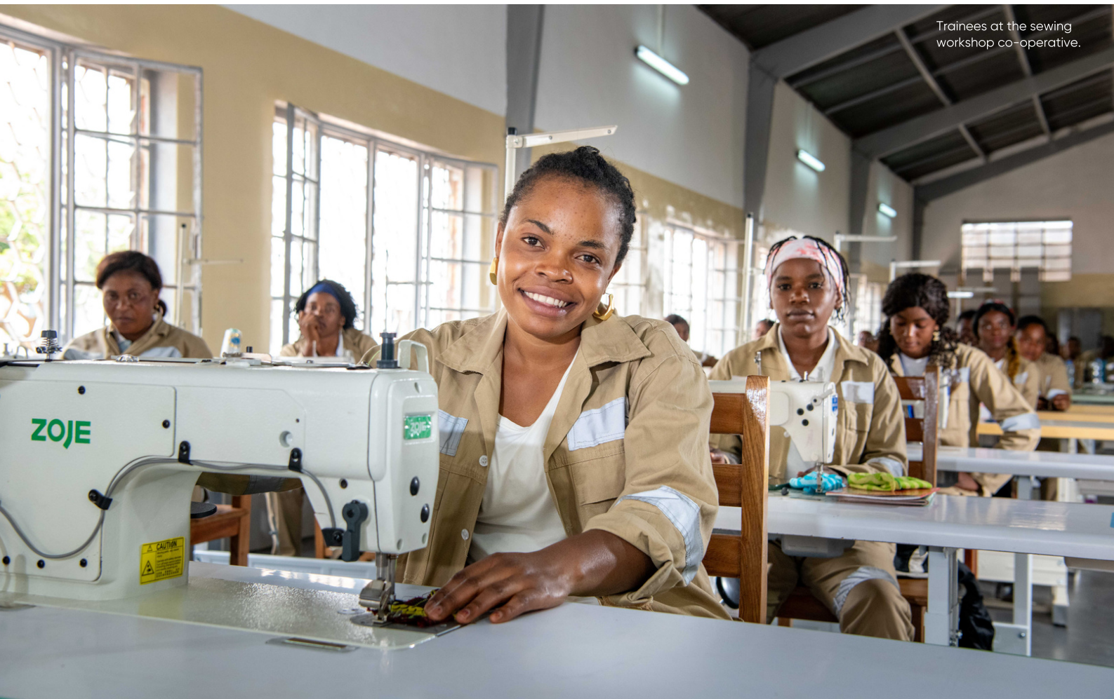
Trainees at the sewing workshop co-operative.