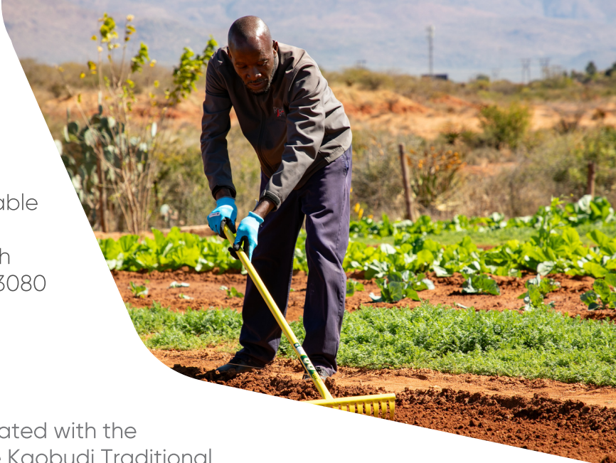
The Platreef team provide vegetable gardening training to local community members.

By coming together and contributing to these families' needs, we not only hope to have improved their living conditions but also honoured the legacy of Nelson Mandela and promoted the values he stood for. Ivanplats is committed to continuing its community initiatives and making a positive impact on the lives of those in need.