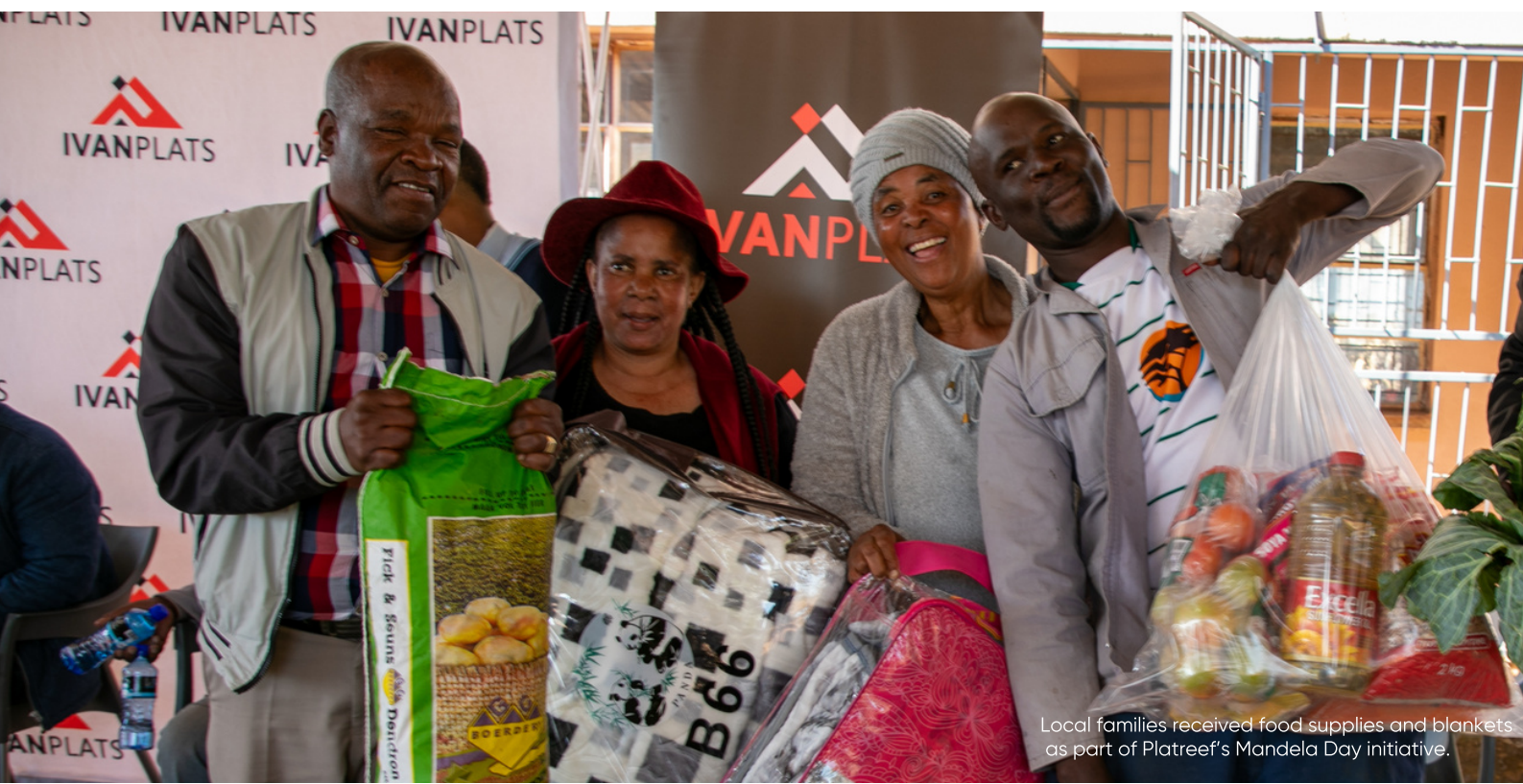
Local families received food supplies and blankets as part of Platreef's Mandela Day initiative.