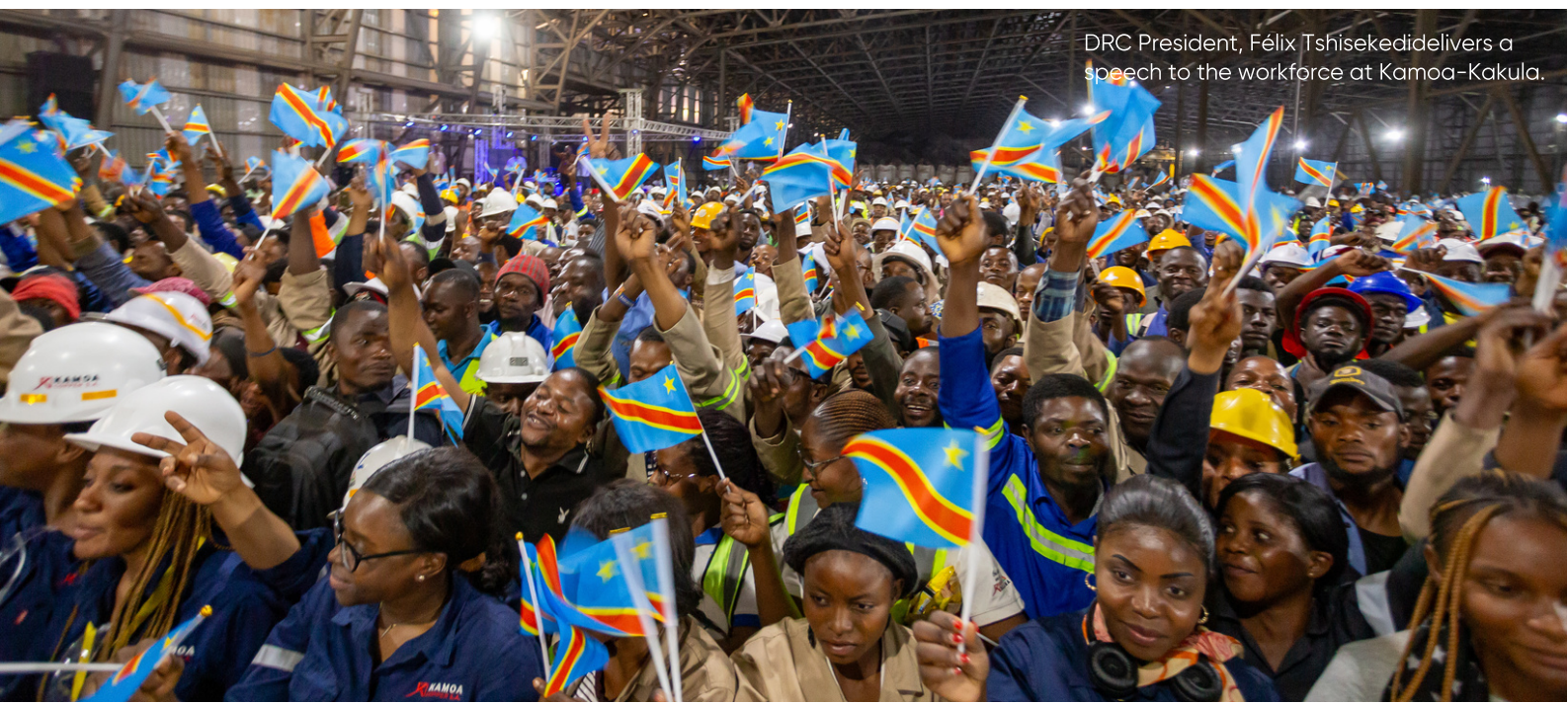
DRC President, Félix Tshisekedi delivers a speech to the workforce at Kamoa-Kakula.