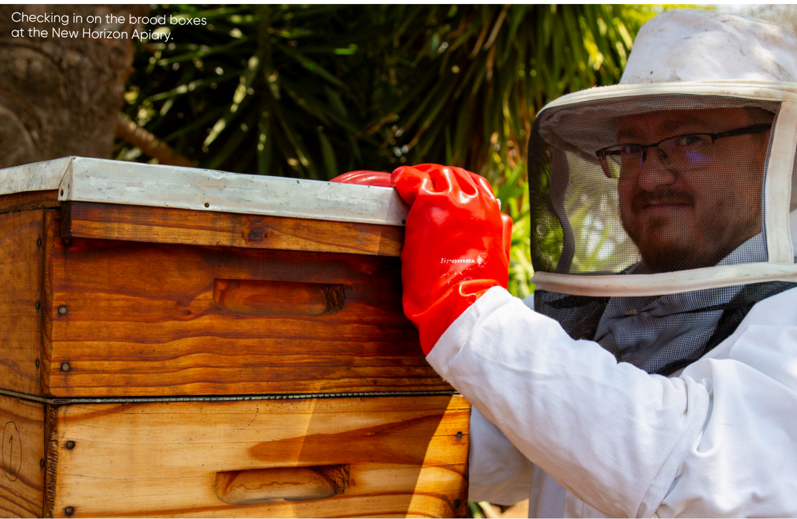
Checking in on the brood boxes at the New Horizon Apiary.