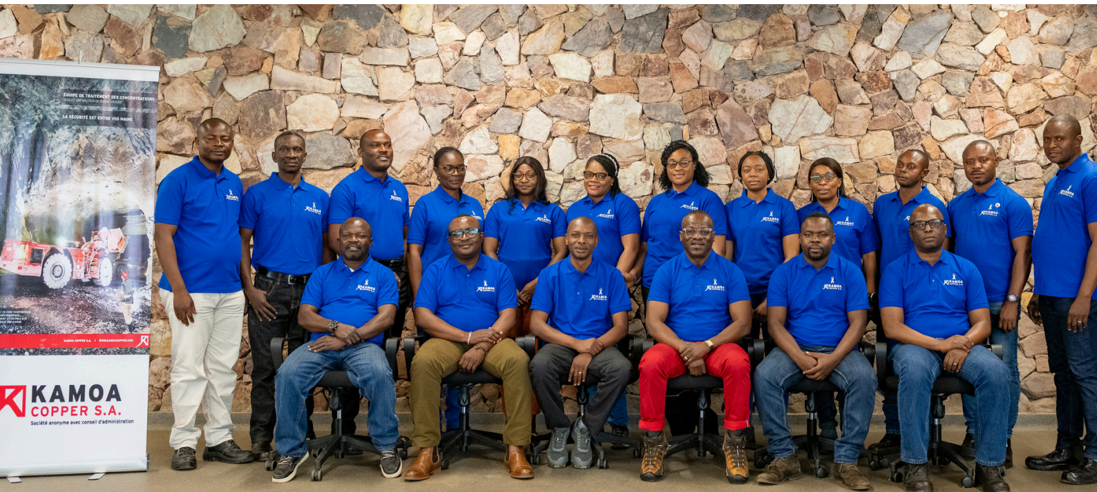
Recipients of the HIV/AIDS management training undertaken at Kamoa-Kakula.