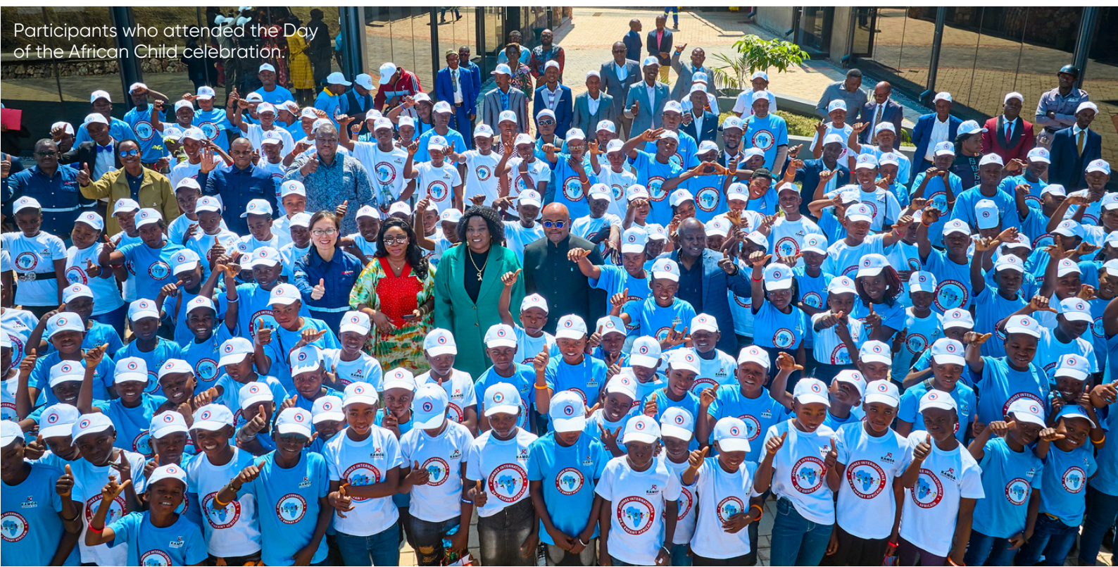
Participants who attended the Day of the African Child celebration.

Education is a key to success and therefore Kamoa is committed to ensuring inclusive and quality education for all children and building resilient education systems to increase access to sustainable and relevant learning curriculums in host communities. The event brought together 230 children from 15 local schools, offering them educational materials and a series of inspirational and informative speeches.