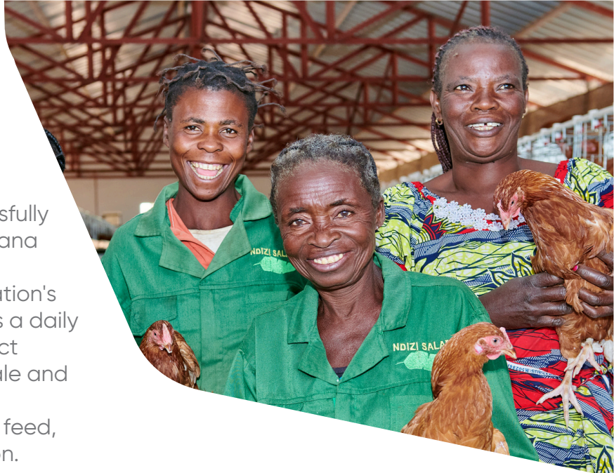
Ndizi Salama owner-employees at the new poultry house.

In May 2024, a new poultry farm was successfully launched adjacent to the Ndizi Salama banana plantation. This initiative, which provides supplemental income for the banana plantation's workforce, houses 2,470 laying hens and has a daily egg production capacity of 2,100. The project benefits 30 individuals, 26 of whom are female and 4 male. Kamoa-Kakula provide support for supplies, the initial equipment, six months of feed, and ongoing training and business education.