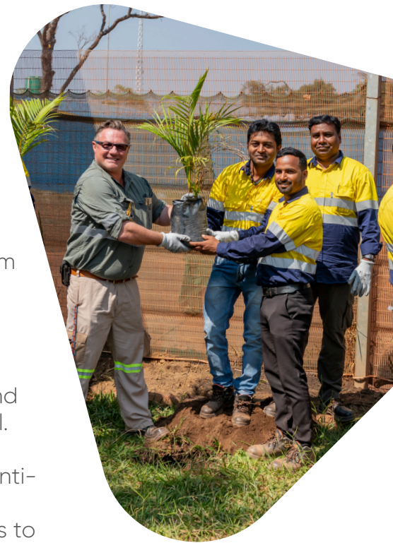
Kamoa-Kakula teams gather to plant trees on World Environmental Day.

We are proud to lead by example in prioritizing our people's health and we look forward to continuing our commitment to employee well-being and setting a new standard for HIV/AIDS care in the workplace.