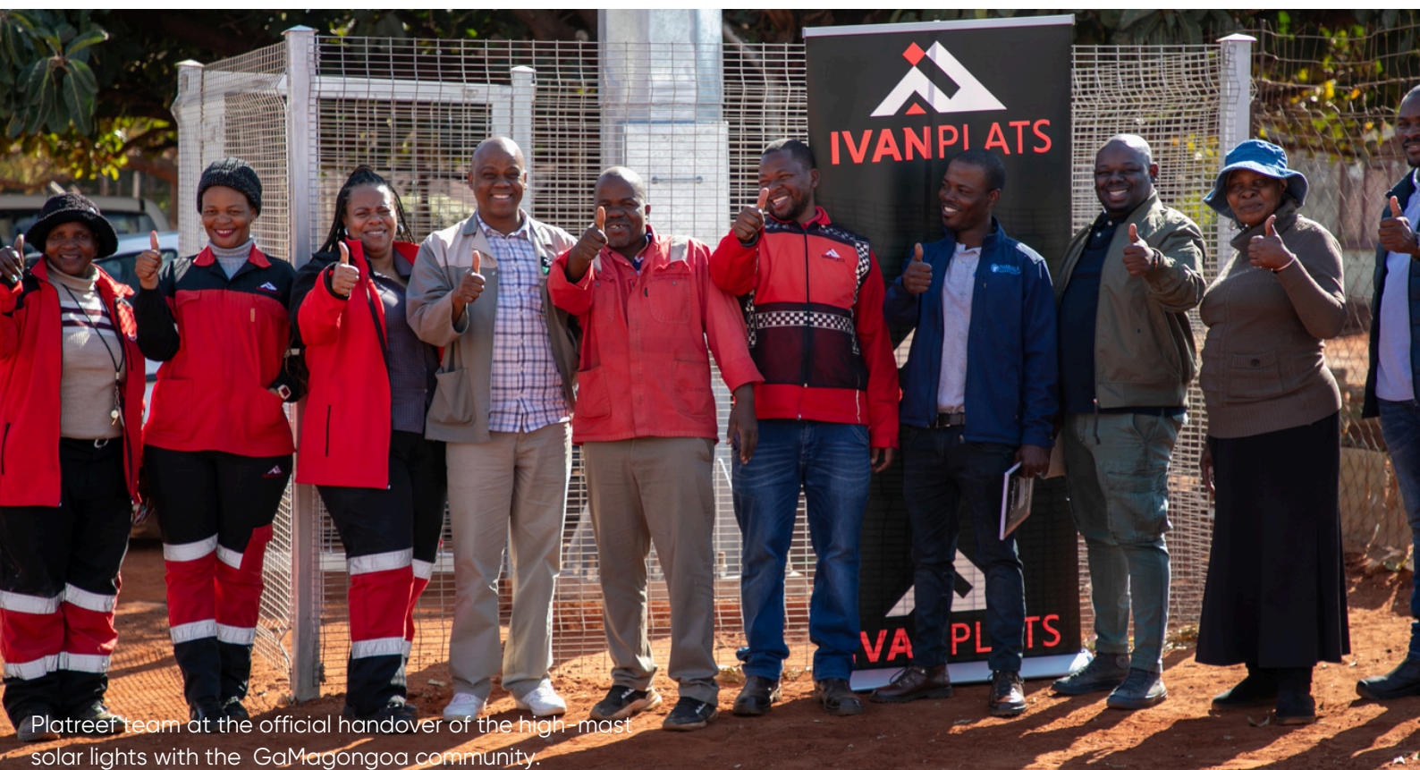
Platreef team at the official handover of the high-mast solar lights with the GaMagongoa community.