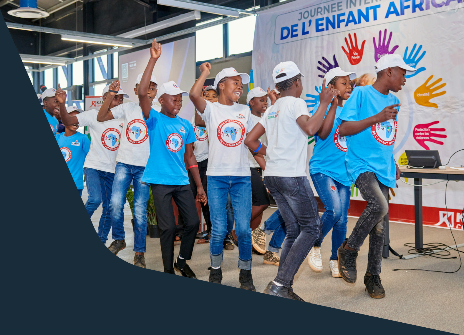
Children dance at the Day of the African Child event held at the Kamoa Centre of Excellence.