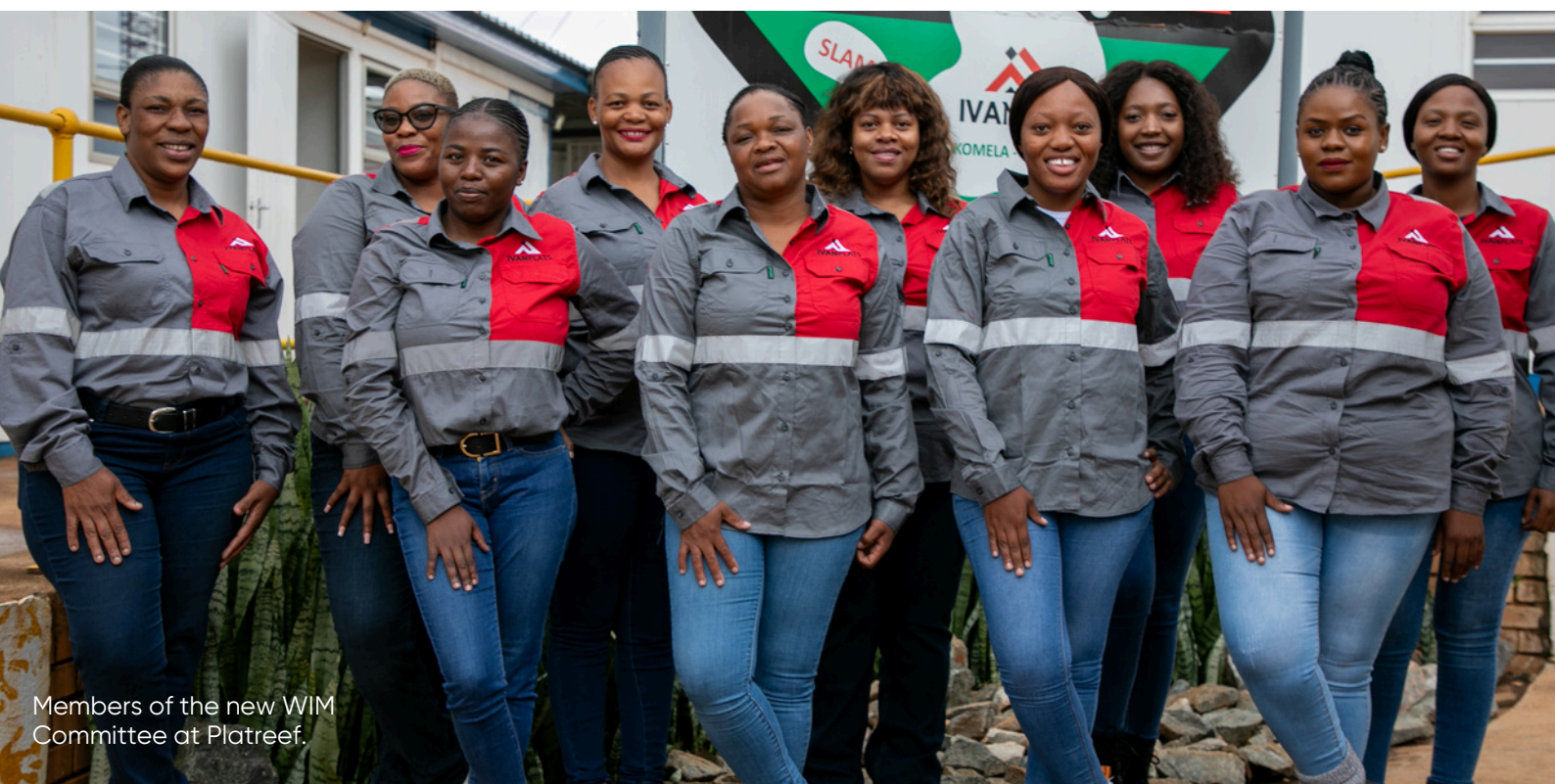
Members of the new WiM Committee at Platreef.