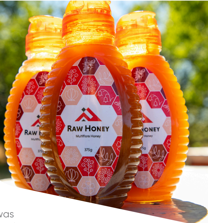
Platreef's first honey harvest.

The Platreef Project's New Horizon Apiary, located on the New Horizons farm, has successfully completed its first honey harvest. This apiary initiative, with its current 43 hives, is dedicated to promoting biodiversity. As the bees increase their activities during the warmer months, we anticipate a larger yield for our sustainable honey production with an extensive harvest planned for the summer season in September 2024.