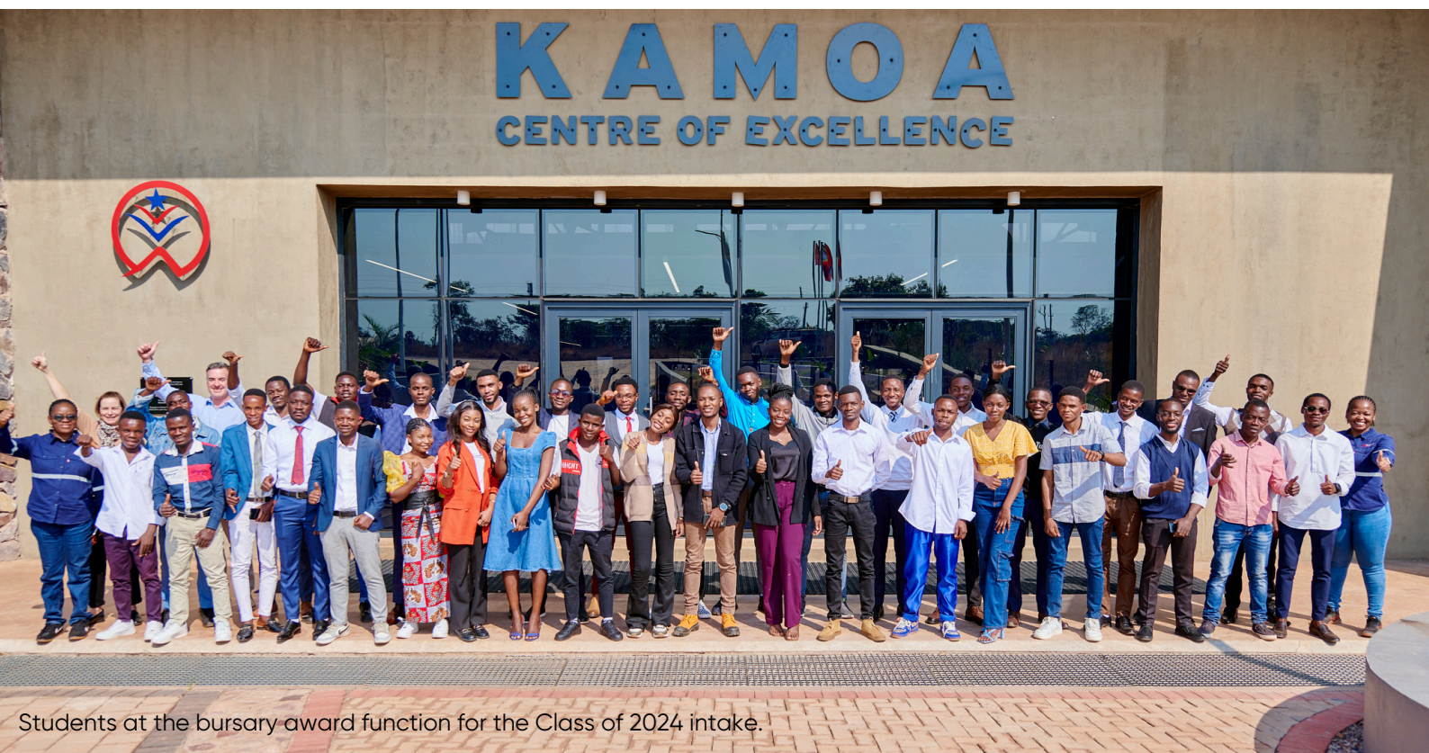
Students at the bursary award function for the Class of 2024 intake.