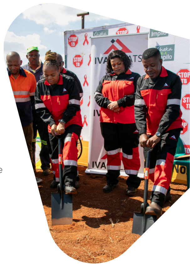
Platreef team at the Tshamahansi clinic soil-turning ceremony.

As part of the Platreef Project's second SLP an official soil-turning ceremony, attended by local and provincial government, as well as local community leadership, was hosted to commemorate the start of the construction work for the new maternity ward at the existing Tshamahansi Clinic, which services Tshamahansi and several neighbouring communities.