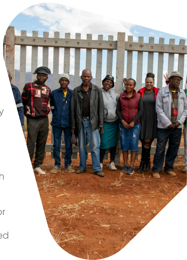
Fence handover at the Kgobudi cemetery.

The Department of Home Affairs officially opened its new offices in Mokopane Town and handed over 100 mobile units to the Home Affairs Offices nationwide during a second-quarter ceremony in the Mahwelereng community. The mobile units aim to enhance service delivery to remote areas far from existing Home Affairs offices. President Cyril Ramaphosa delivered the keynote address. The Platreef Project also showcased its mobile office and engaged with the community during the event.