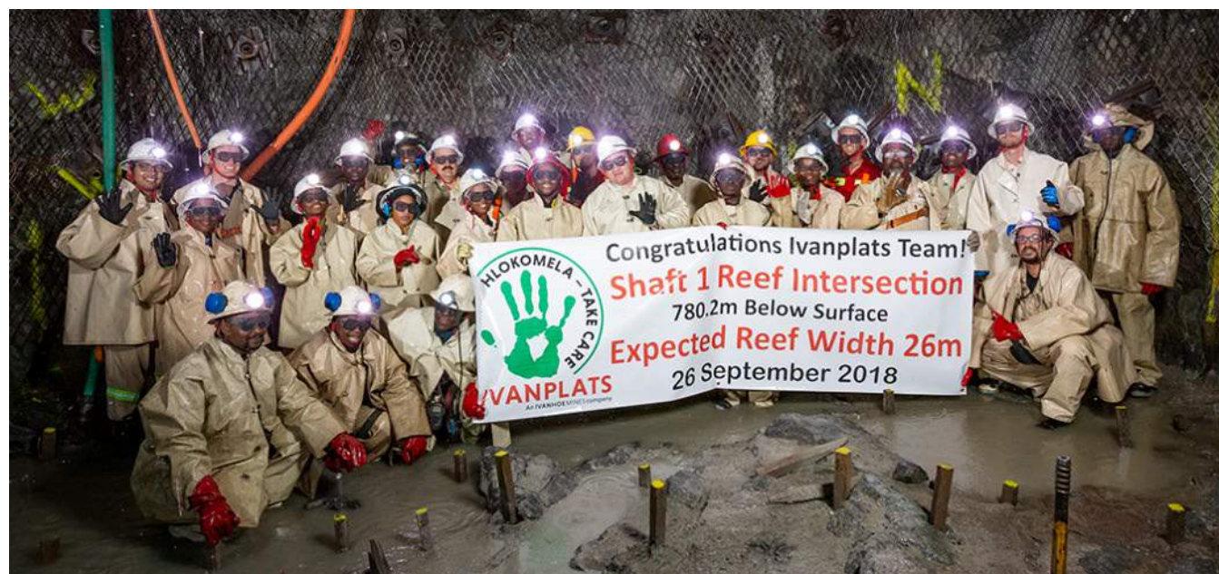
Photo: Members of the Platreef Project team and its South African sinking contractor, Aveng Mining, in Shaft 1 at the intersection of the Flatreef Deposit.

In July 2017, Ivanhoe issued an independent, definitive feasibility study (DFS) for Platreef covering the first phase of production at an initial mining rate of four million tonnes per annum (Mtpa). The DFS estimated that Platreef’s initial, average annual production rate will be 476,000 ounces of platinum, palladium, rhodium and gold, plus 21 million pounds of nickel and 13 million pounds of copper.