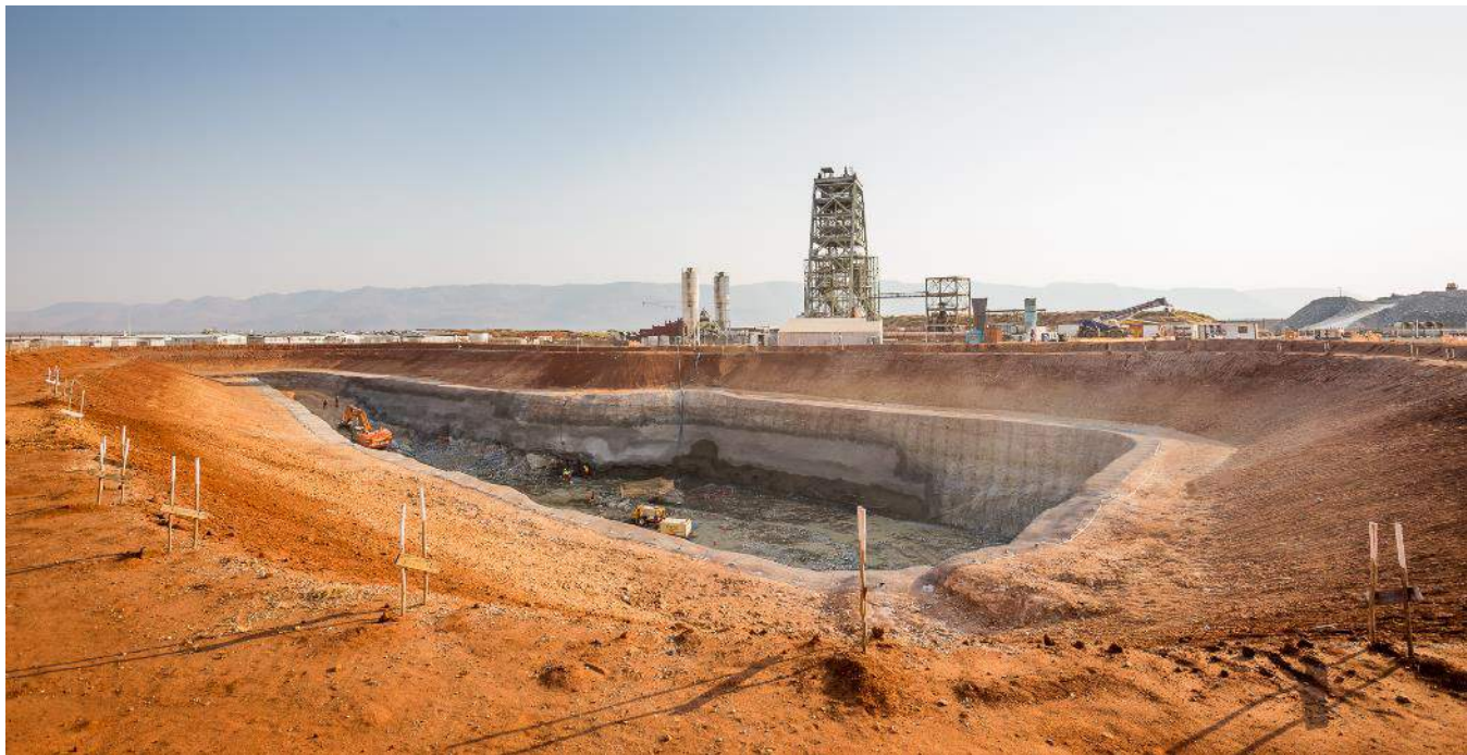
Photo: Platreef's Shaft 2 box cut, with Shaft 1 headframe in the background.