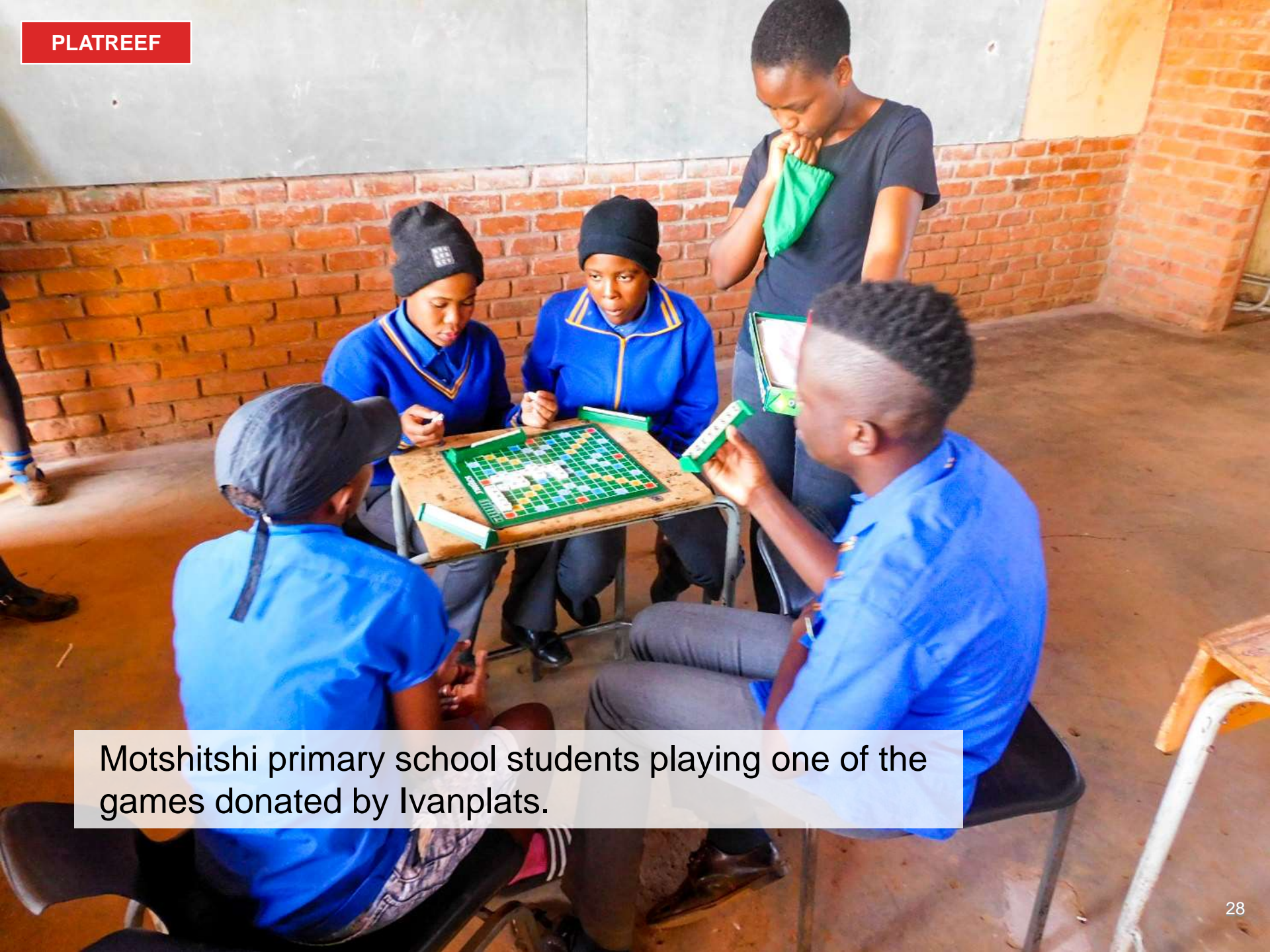
Motshitshi primary school students playing one of the games donated by Ivanplats.