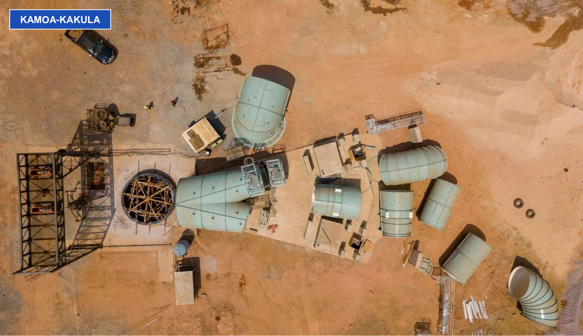
Overhead view of Kakula's new ventilation shaft 1 with the high-capacity fans and ventilation system being installed.