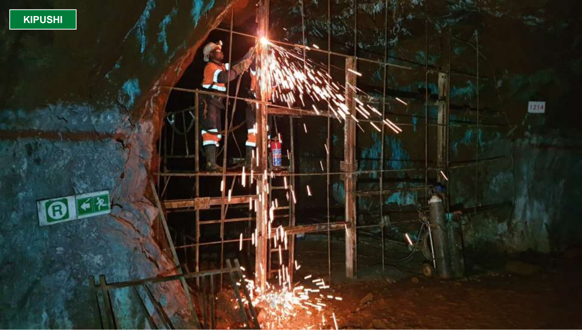
A welder working on the steel frame for a concrete ventilation seal being constructed at Kipushi's 1,214-metre level.