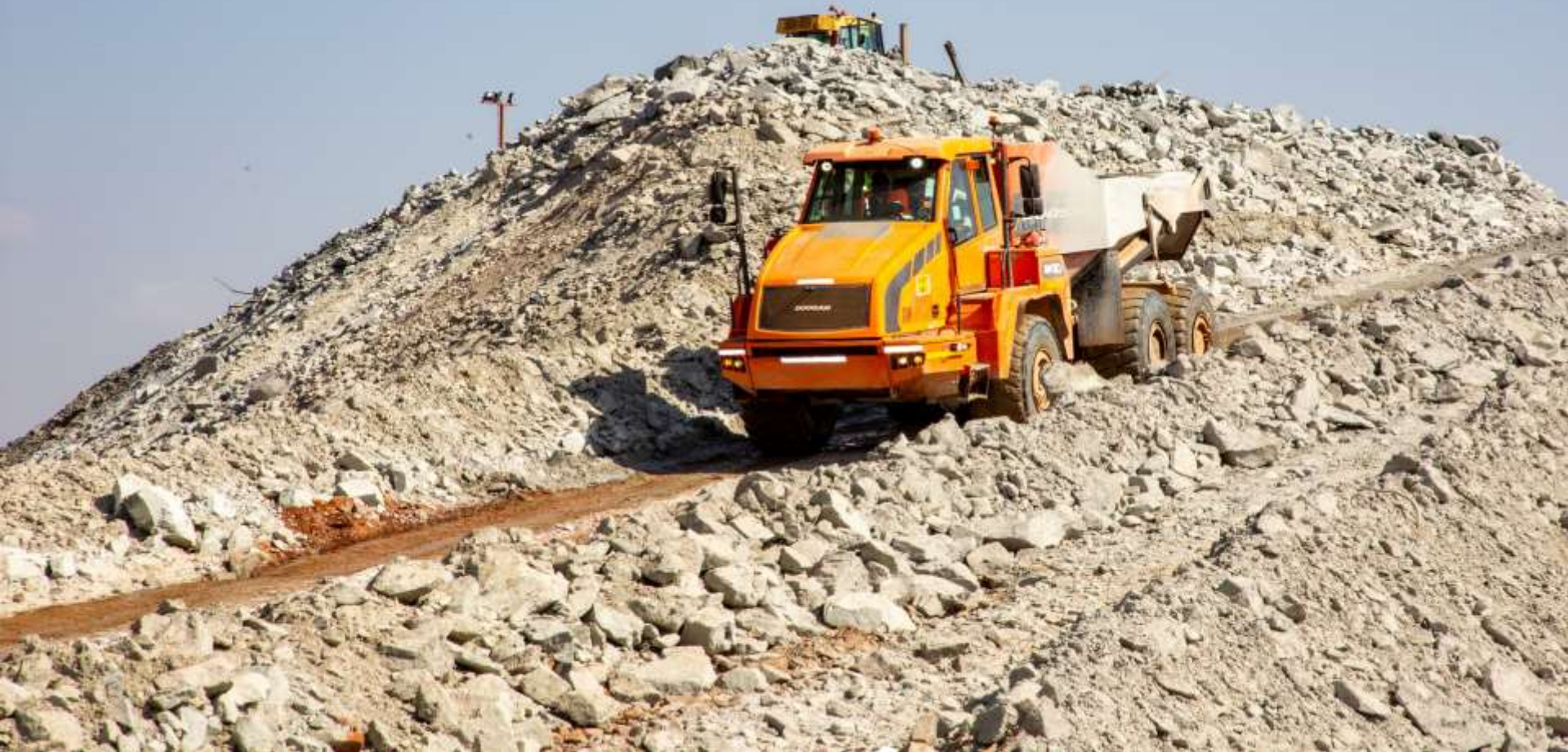
Stockpiling blasted rock from ongoing shaft-sinking operations at Platreef.