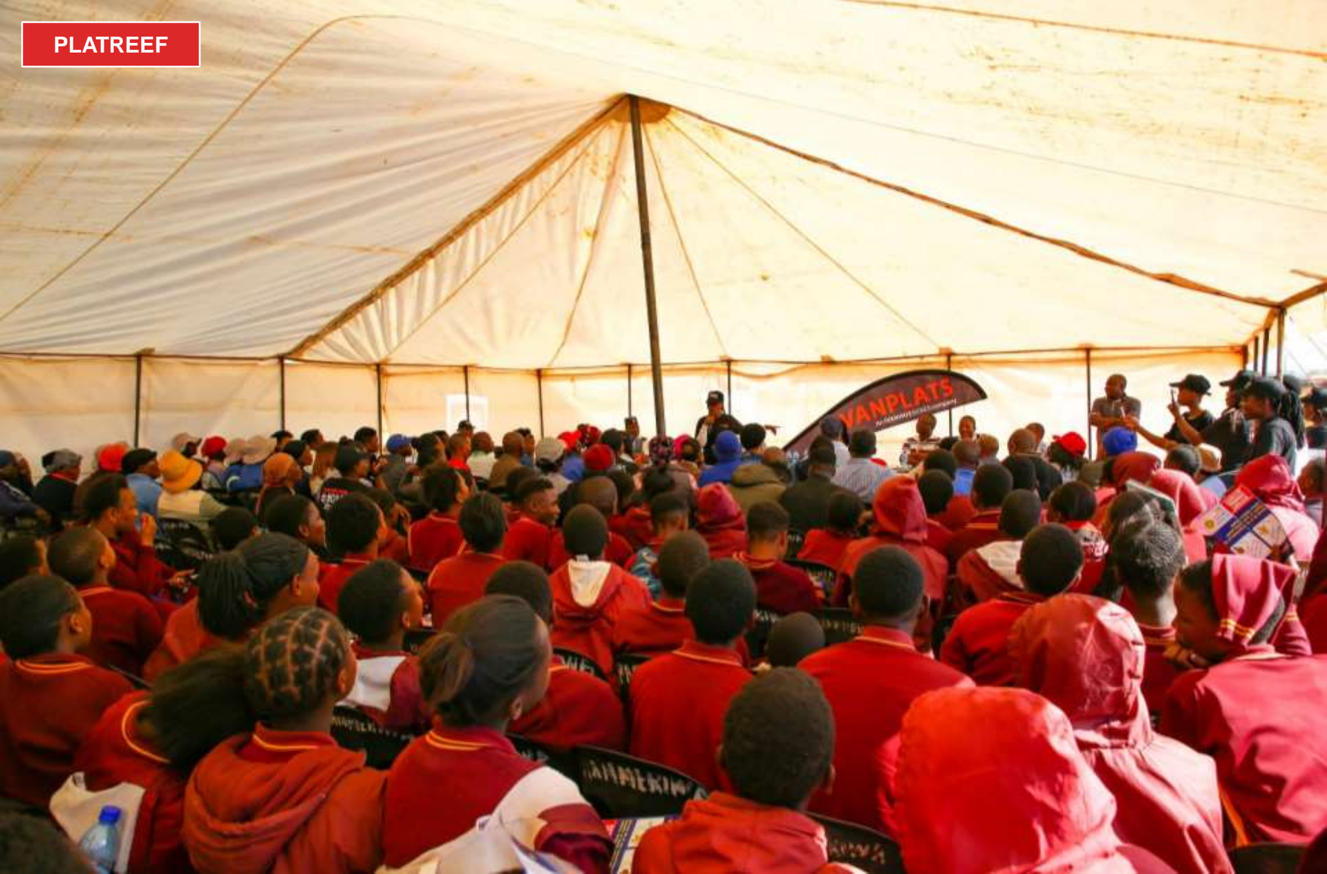
High school students and community members listening to a speaker during the Ivanplats-sponsored drug and substance abuse campaign.