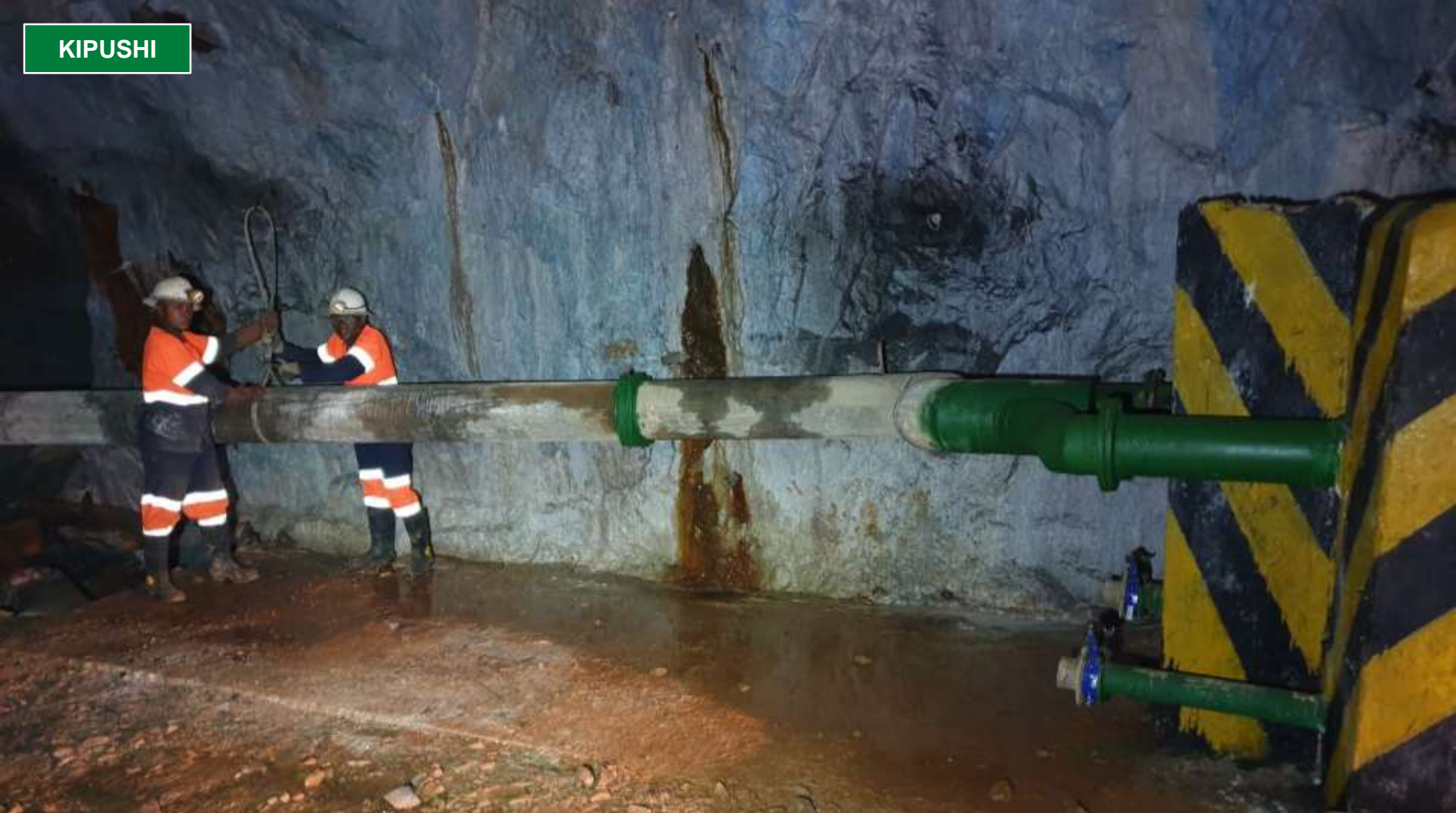
Workers installing an overflow water pipe from an underground dam on the 1,175-metre level.