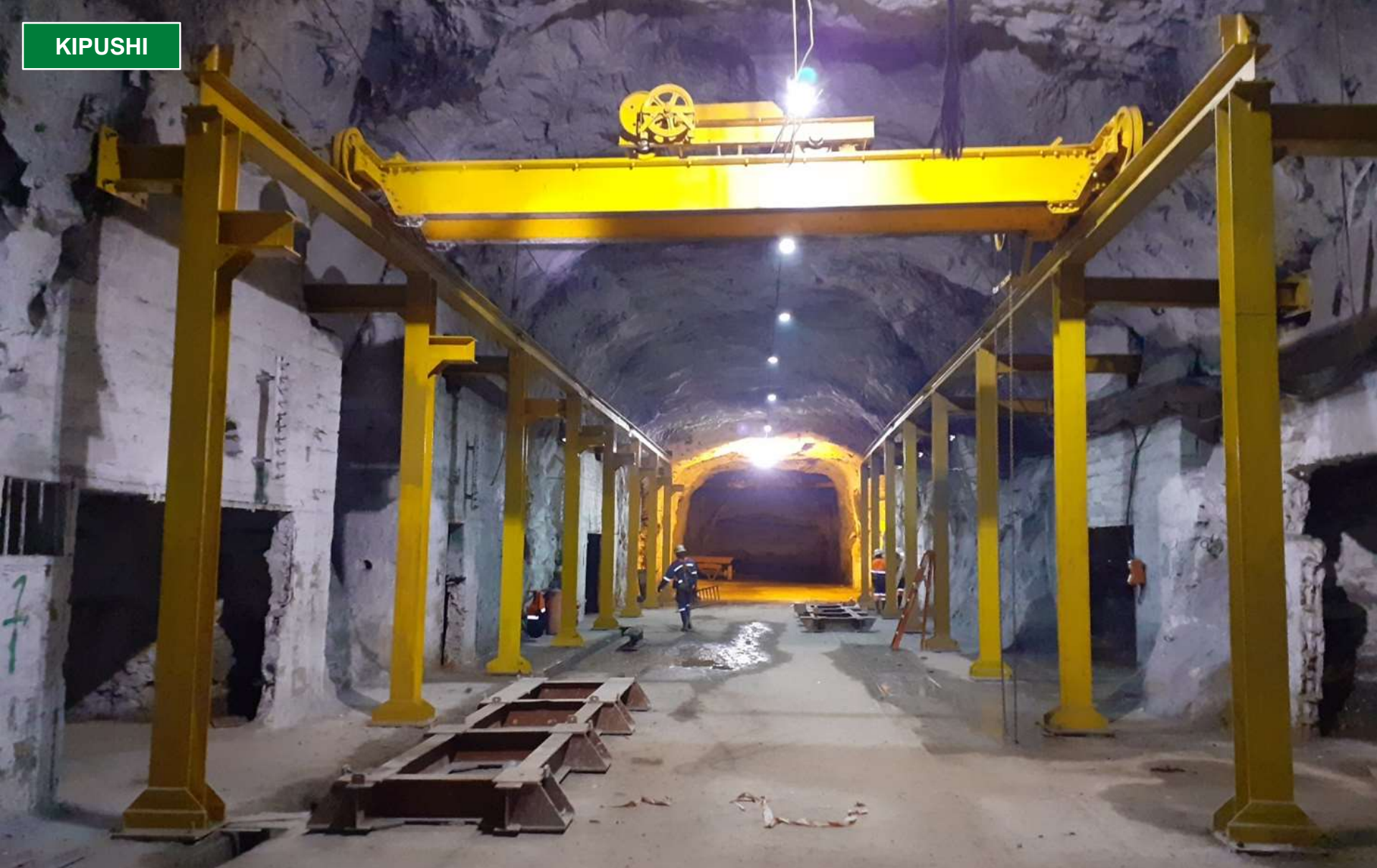
Kipushi's newly installed 85,000-pound capacity overhead crane at the 850-metre level.