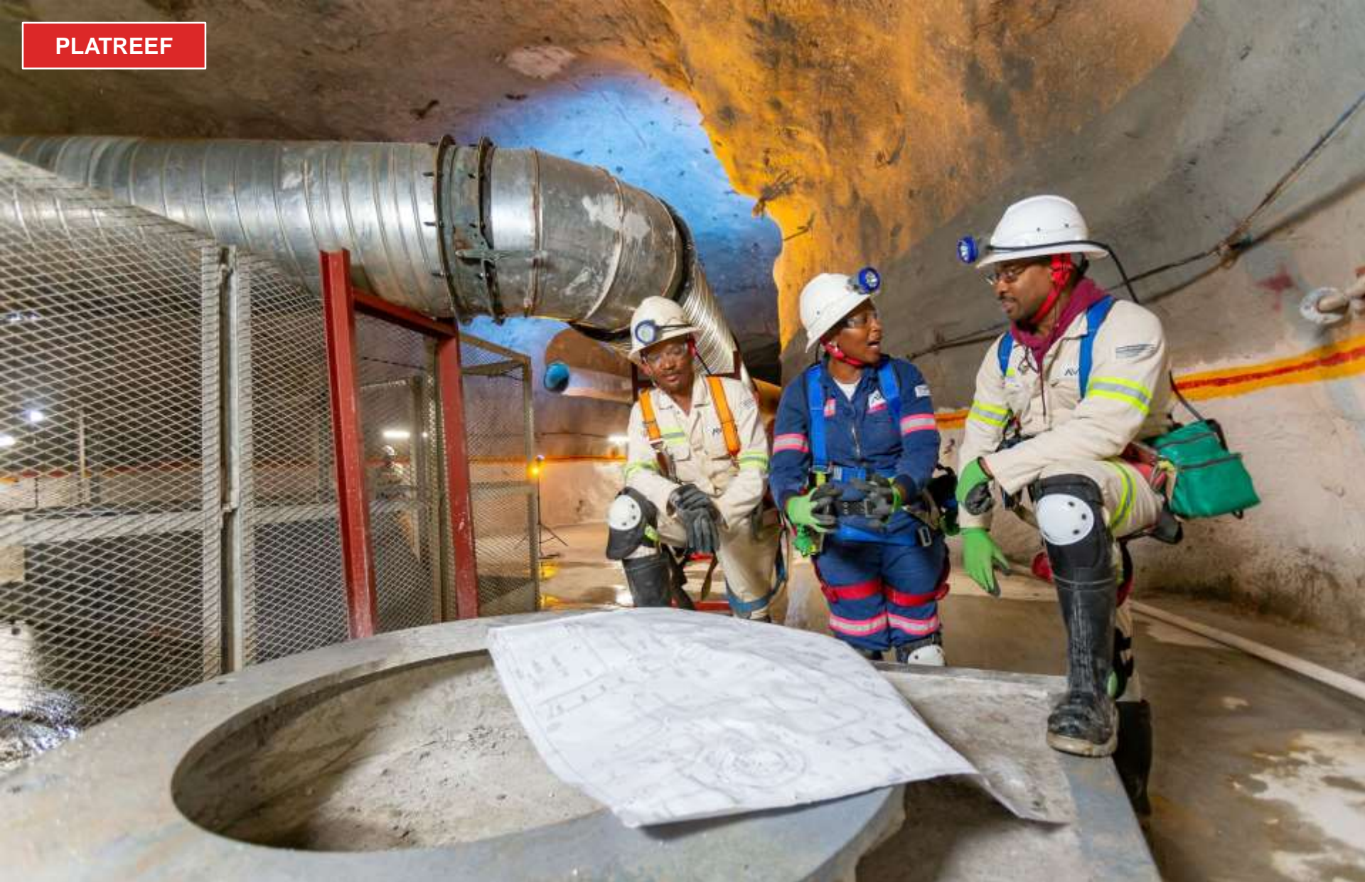
Members of Platreef's engineering team discussing development plans for Shaft 1's final station at a depth of 950 metres below surface.