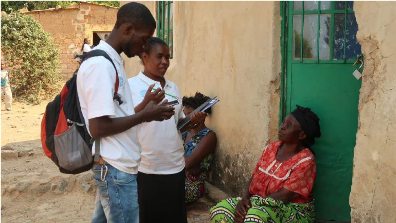
IFP workers utilizing mapping and tracking technology in the Kipushi community.