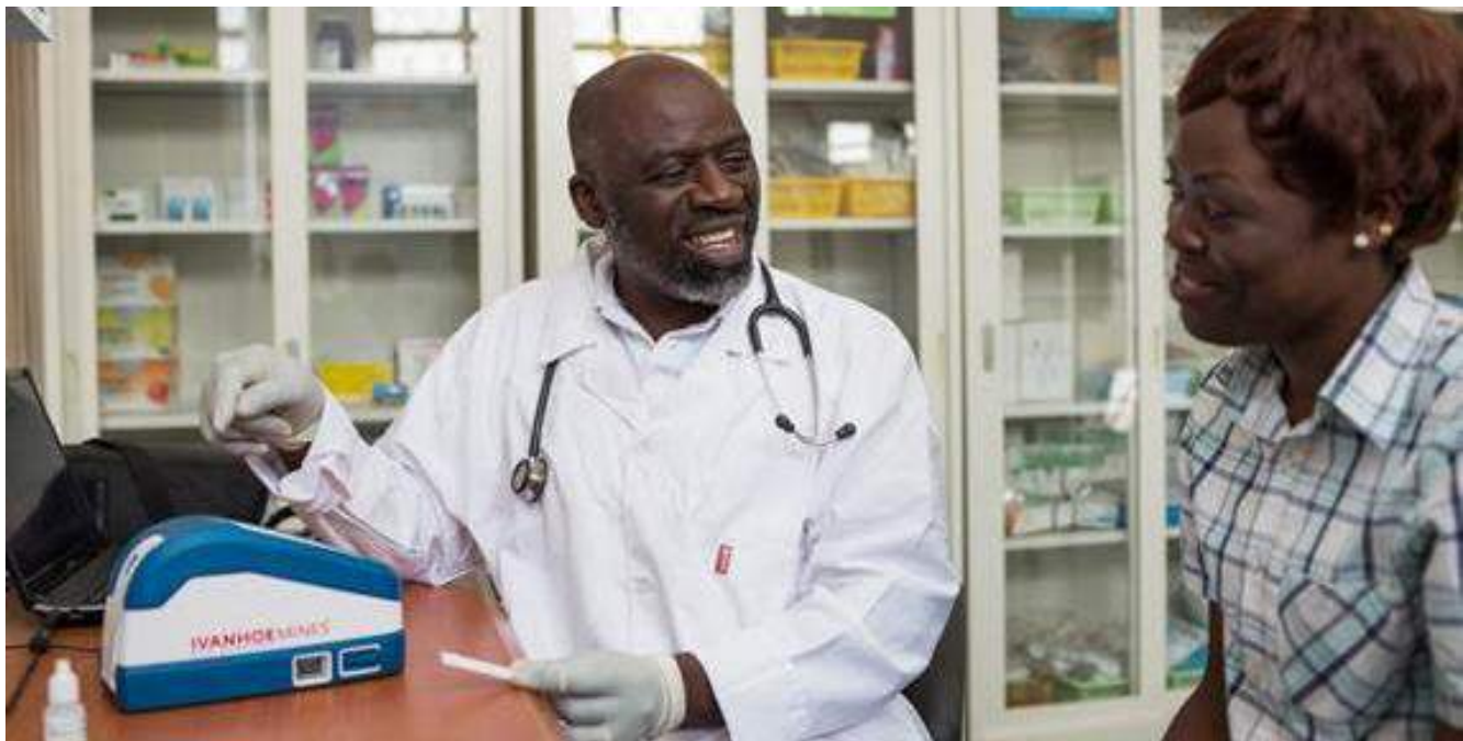
Diagnostic testing, using a Deki Reader, in one of 248 medical centres in southern DRC as part of a malaria-control initiative sponsored by Ivanhoe Mines and Zijin Mining.

One significant overall benefit of Know for Sure is that a total of 248 private and public health facilities now offer on-the-spot malaria testing services to rural communities and urban centres, guiding treatment according to national protocols. Health workers at these facilities are using 300 Deki Readers, Fio's intelligent diagnostic device based on mobile phone technology, to help them more accurately diagnose malaria and record results.