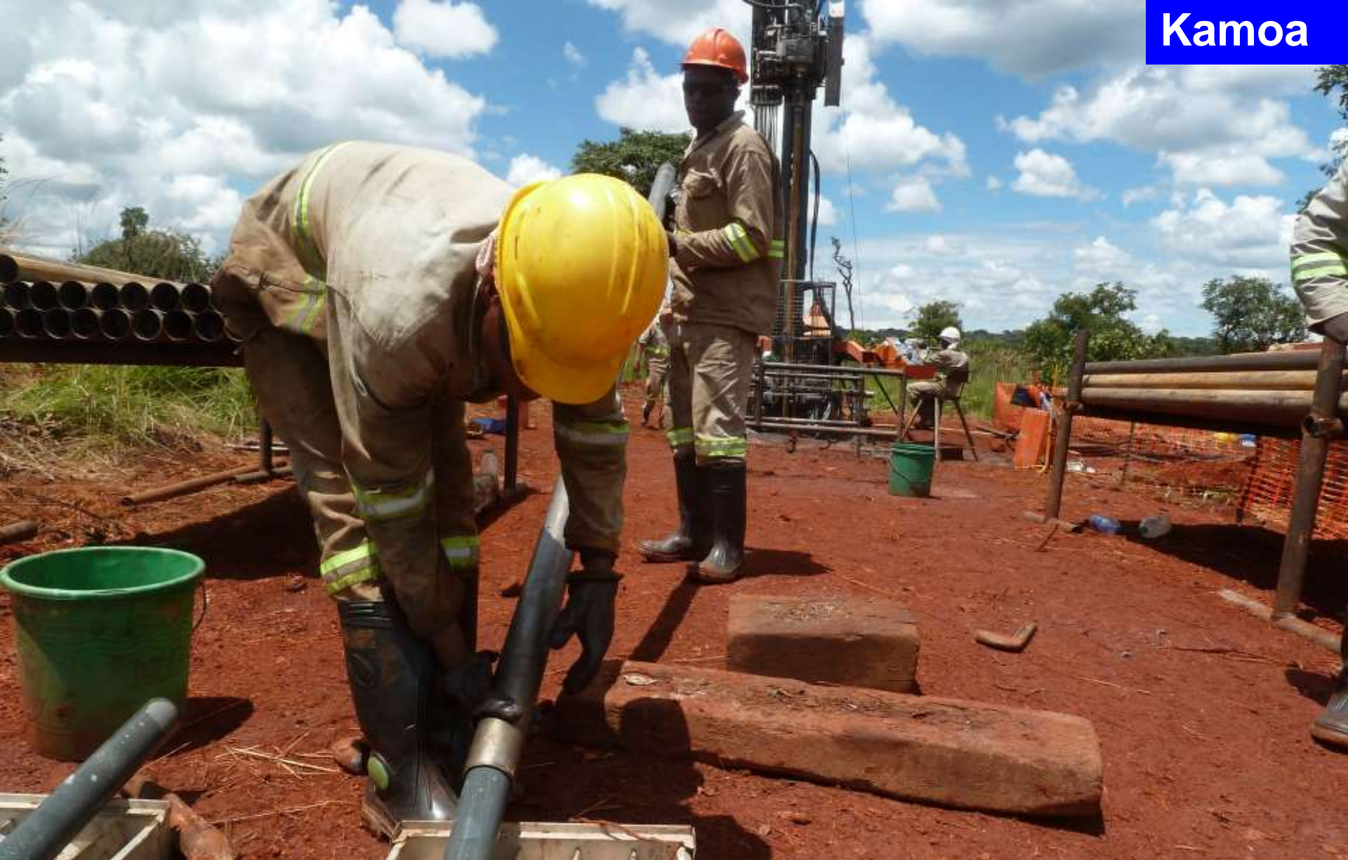
Exploration drilling at the Kakula copper discovery area