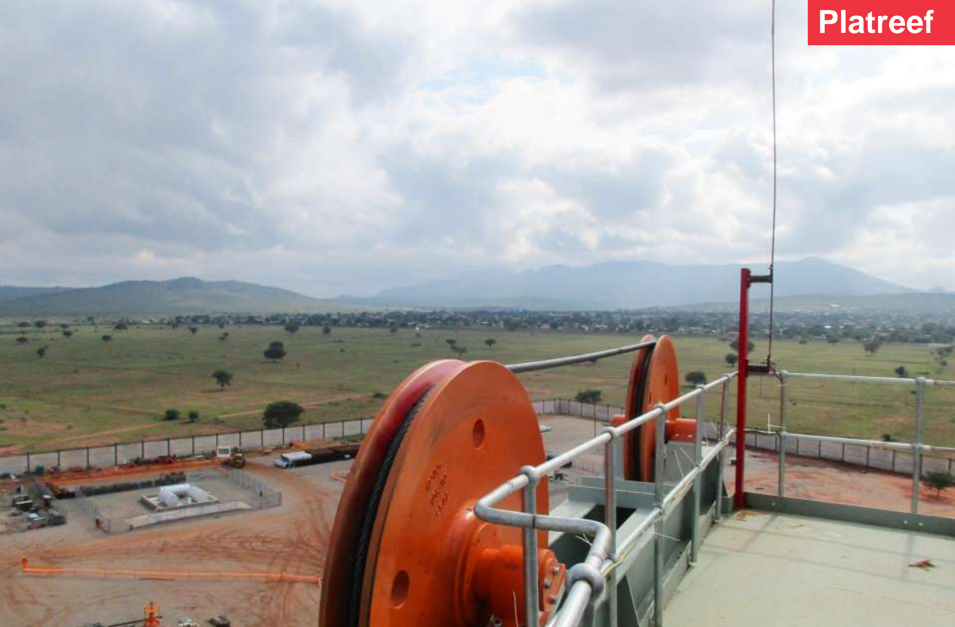
Cable installation completed on the stage-winder sheave wheels