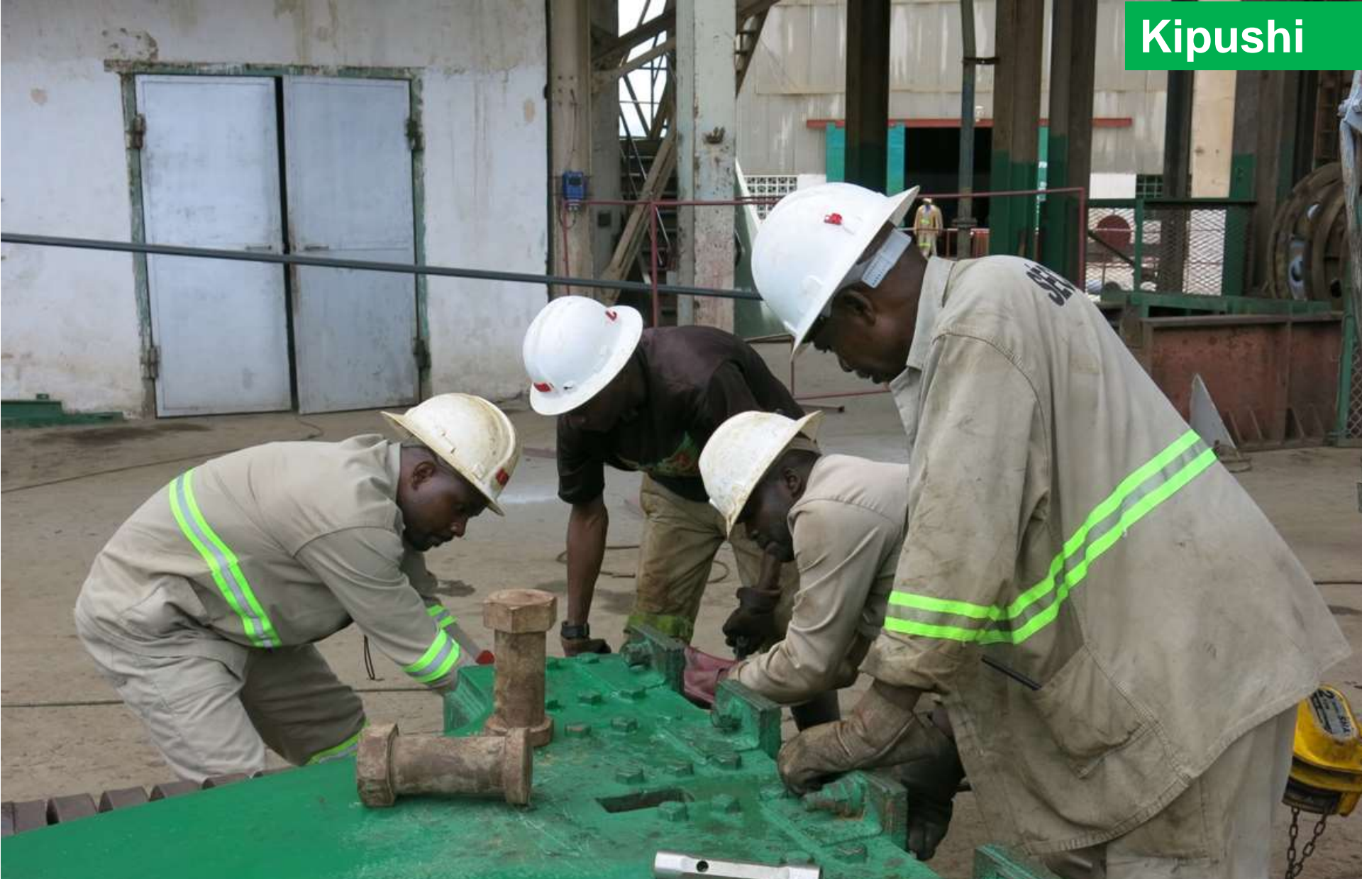
Workers refurbishing Shaft 5 counterweight bridle