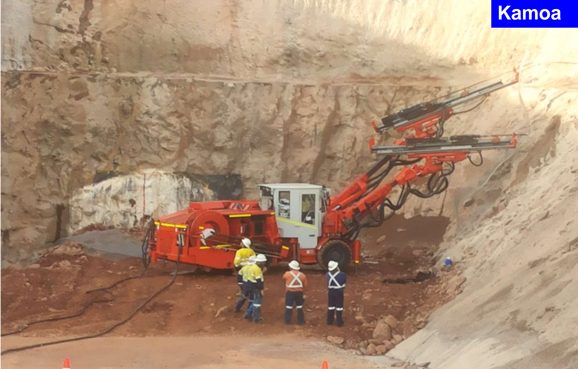
Drilling of anchor-bolt holes for the box-cut wall support