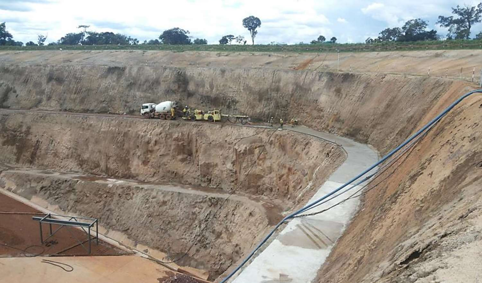
Progress on the concrete platform on the box cut's second bench