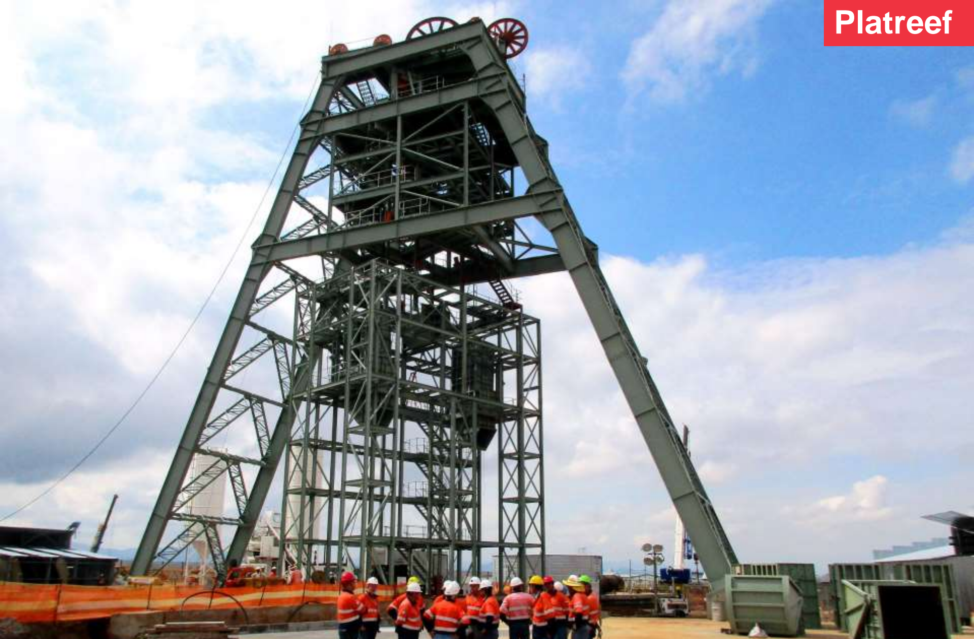
Weekly inspection of progress at Platreef development site