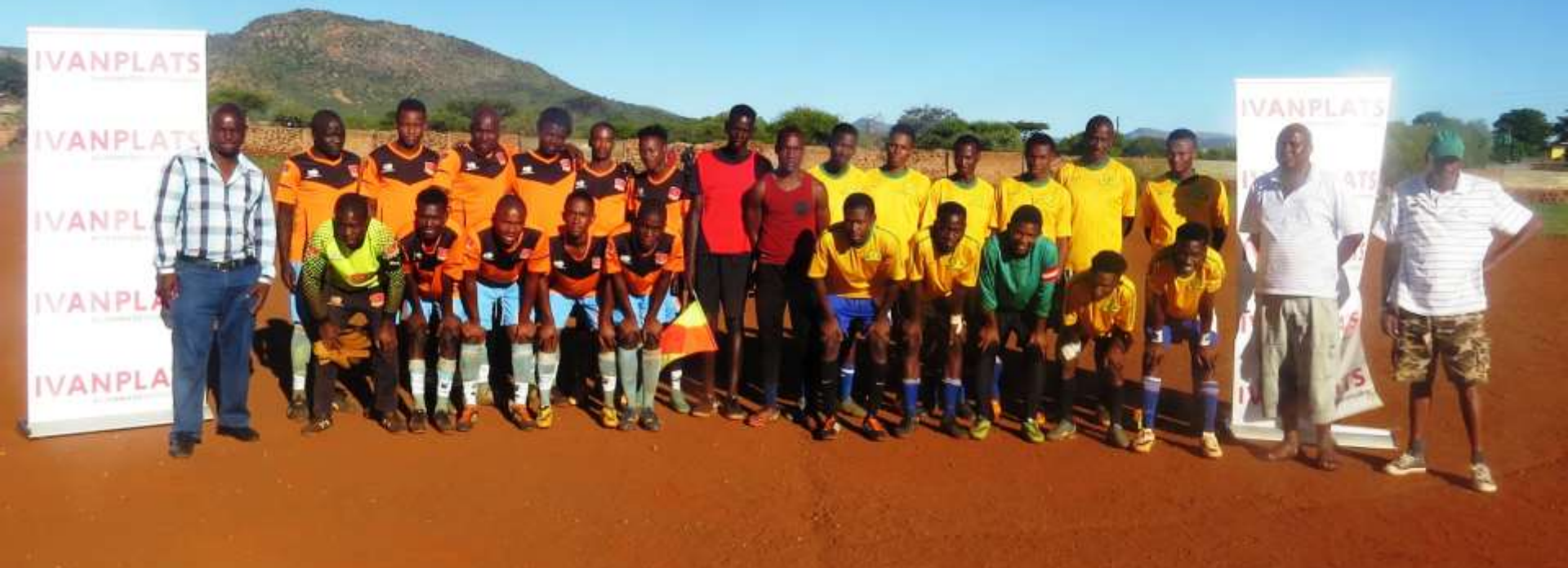
Two local soccer teams that participated in the Ivanplats-sponsored Tshamahansi Easter tournament