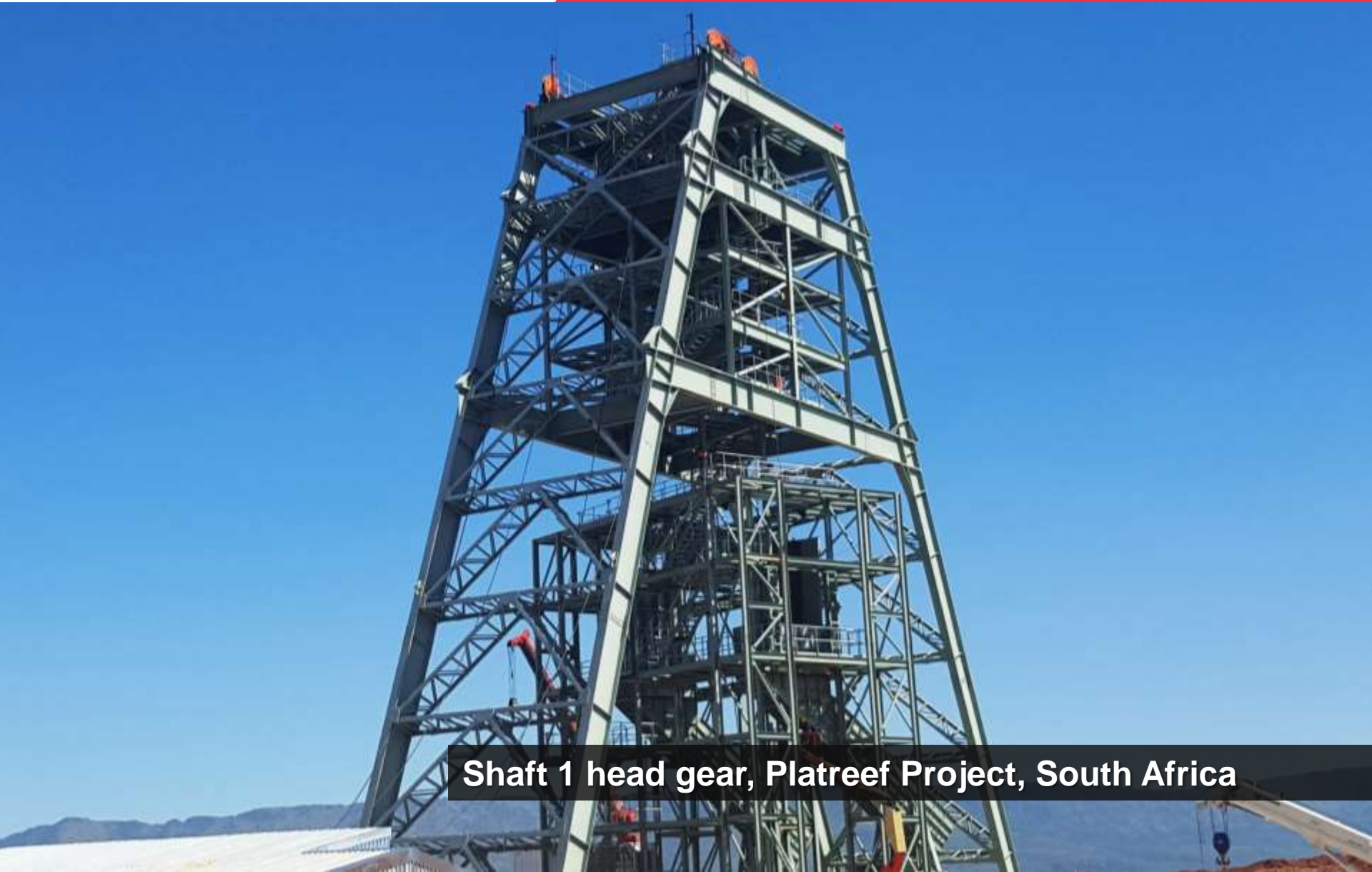
Shaft 1 head gear, Platreef Project, South Africa