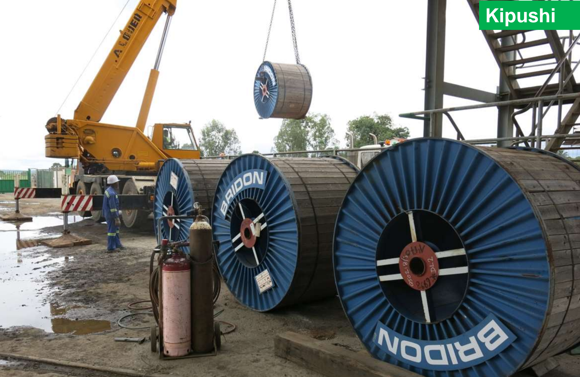
Off-loading new cable for the Shaft 5 man winder