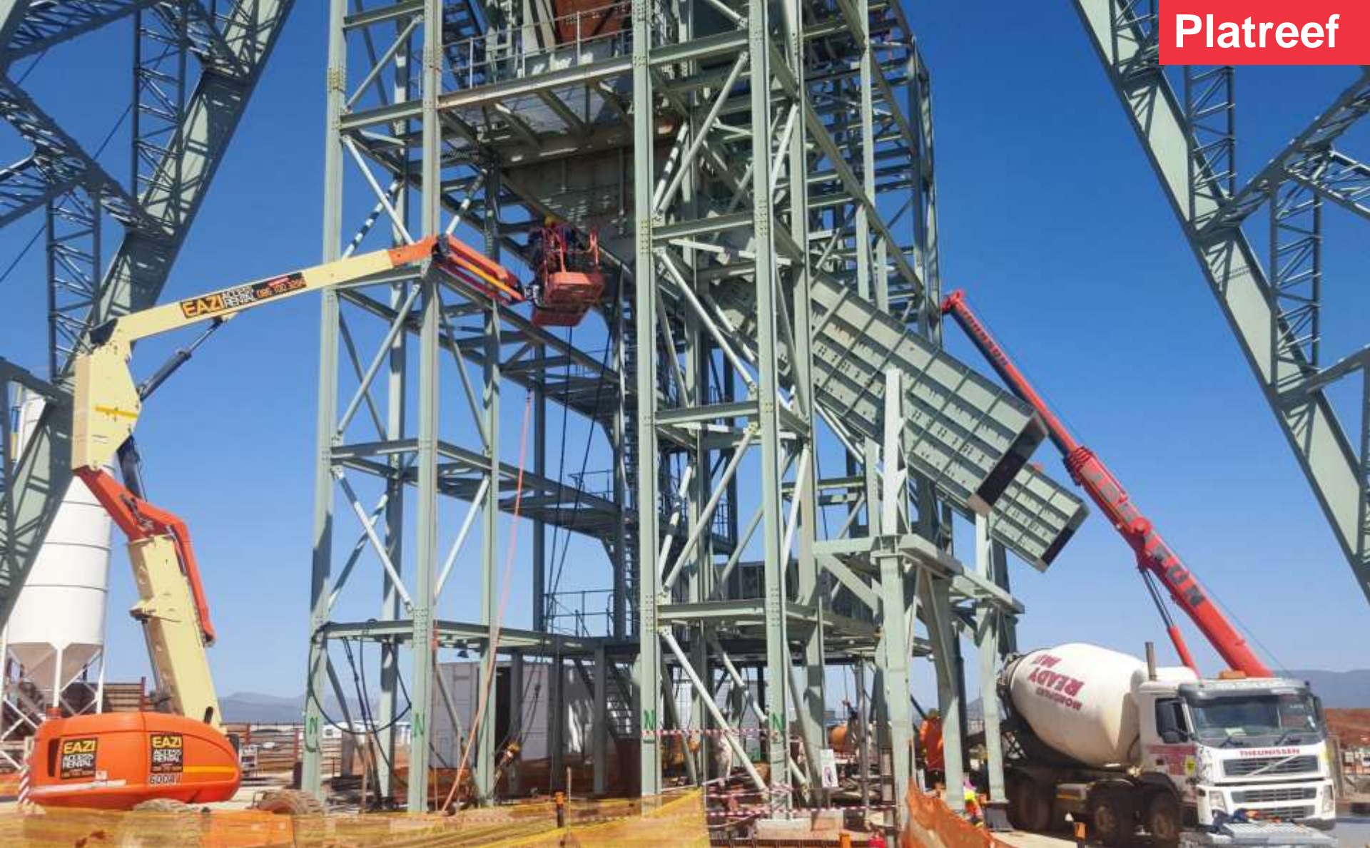
Chute installation on the head-gear centre tower