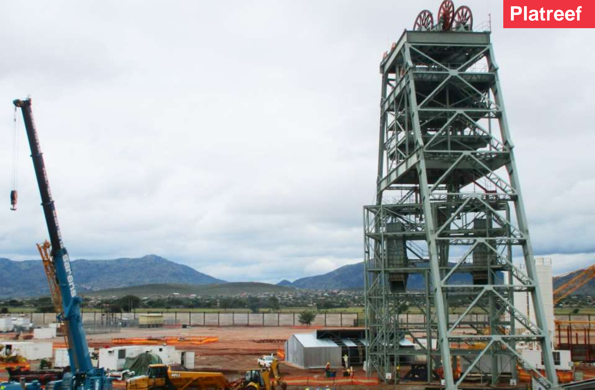
Civil works around Shaft 1 head gear