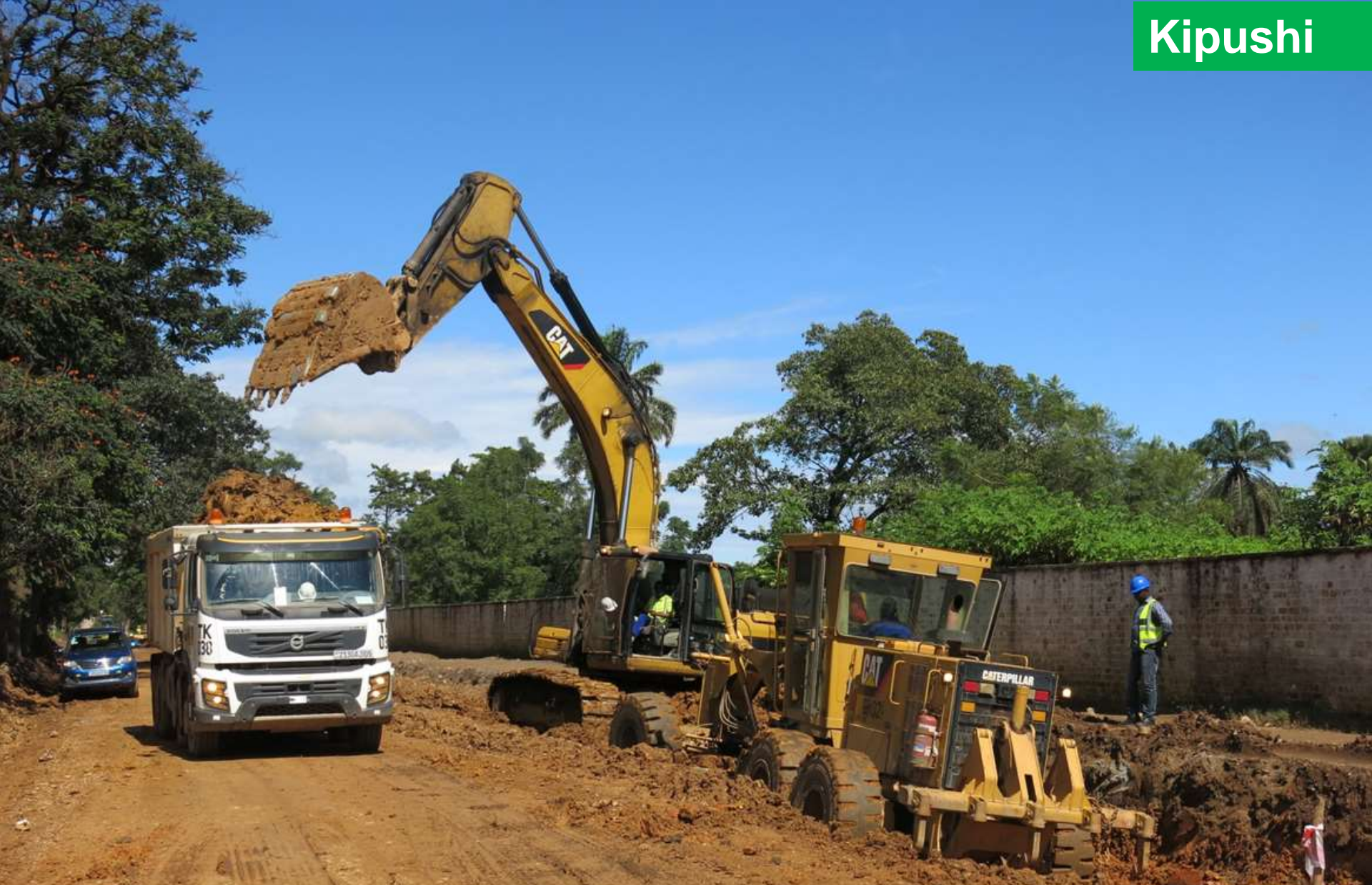
MCK equipment excavating below the sub-base on the Kipushi road rehabilitation