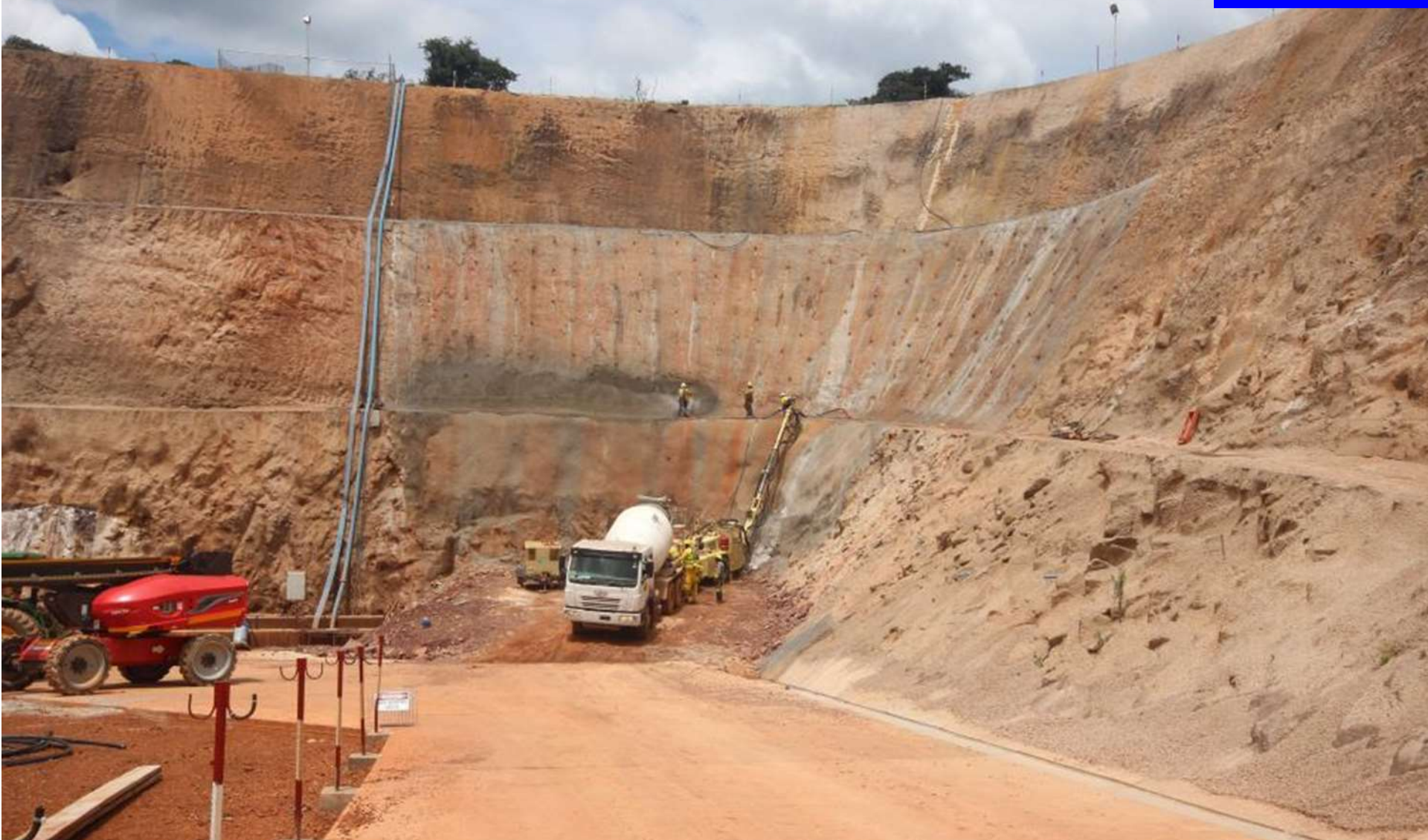
Applying shotcrete to seal and stabilize exposed slopes of the Kamoa box cut