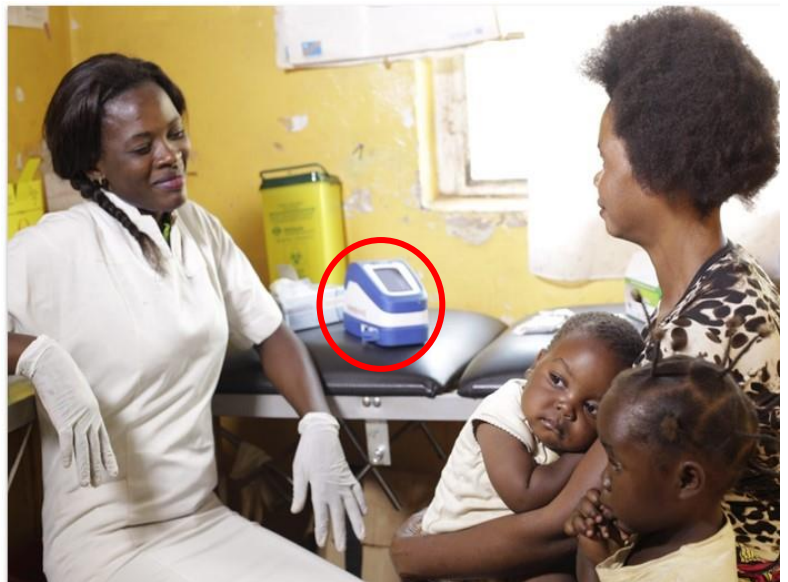
Health workers use the handheld, touch-screen Deki Readers (circled) to enter patient information, help diagnose malaria and record and share useful data, including symptoms, test results and treatment.

Fio Corporation , of Toronto, Canada, is providing the technology and Chemonics International , a Washington, USA-based international development company, is providing in-field training, service and support.